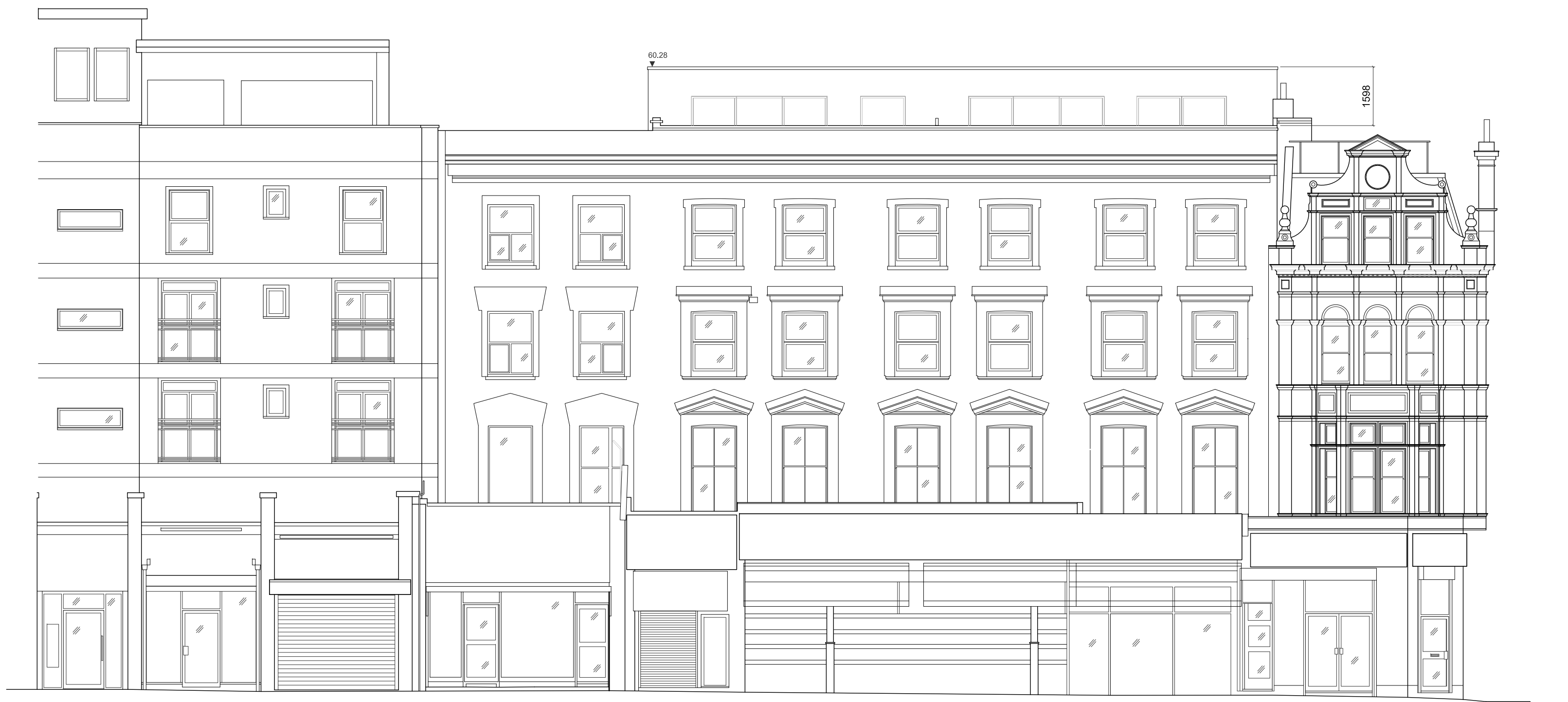
1 EXISTING ELEVATION 1 SCALE 1:100