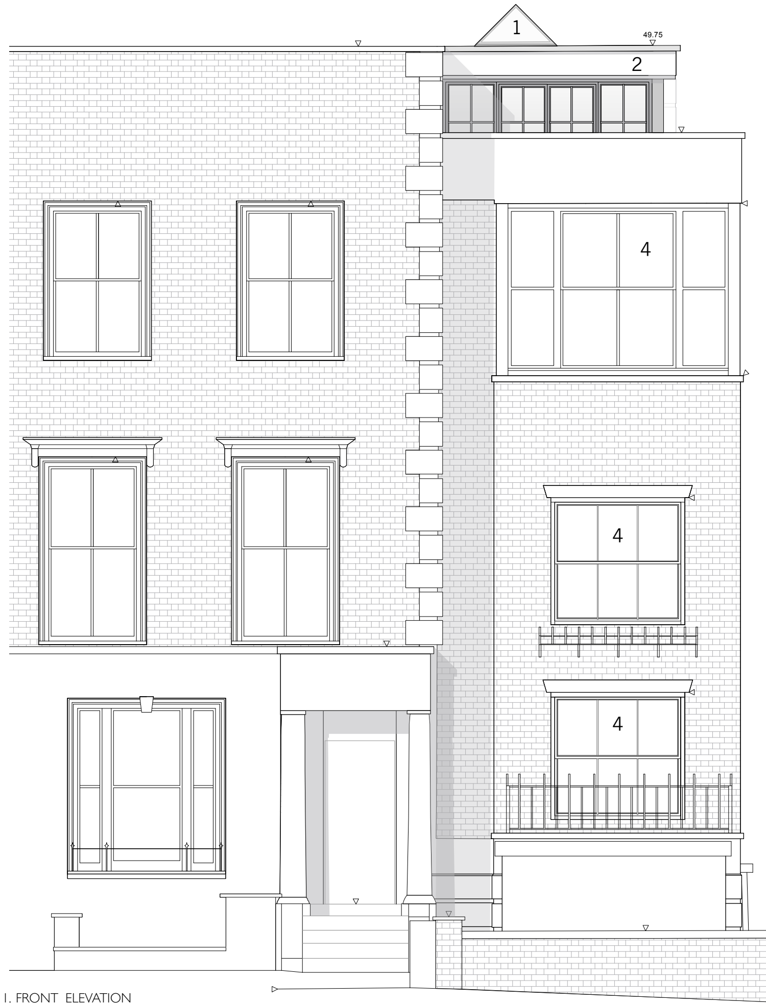
I. FRONT ELEVATION