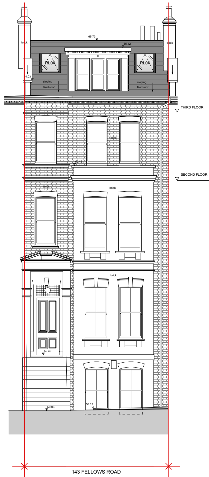
01 Proposed Front Elevation Scale: 1:100