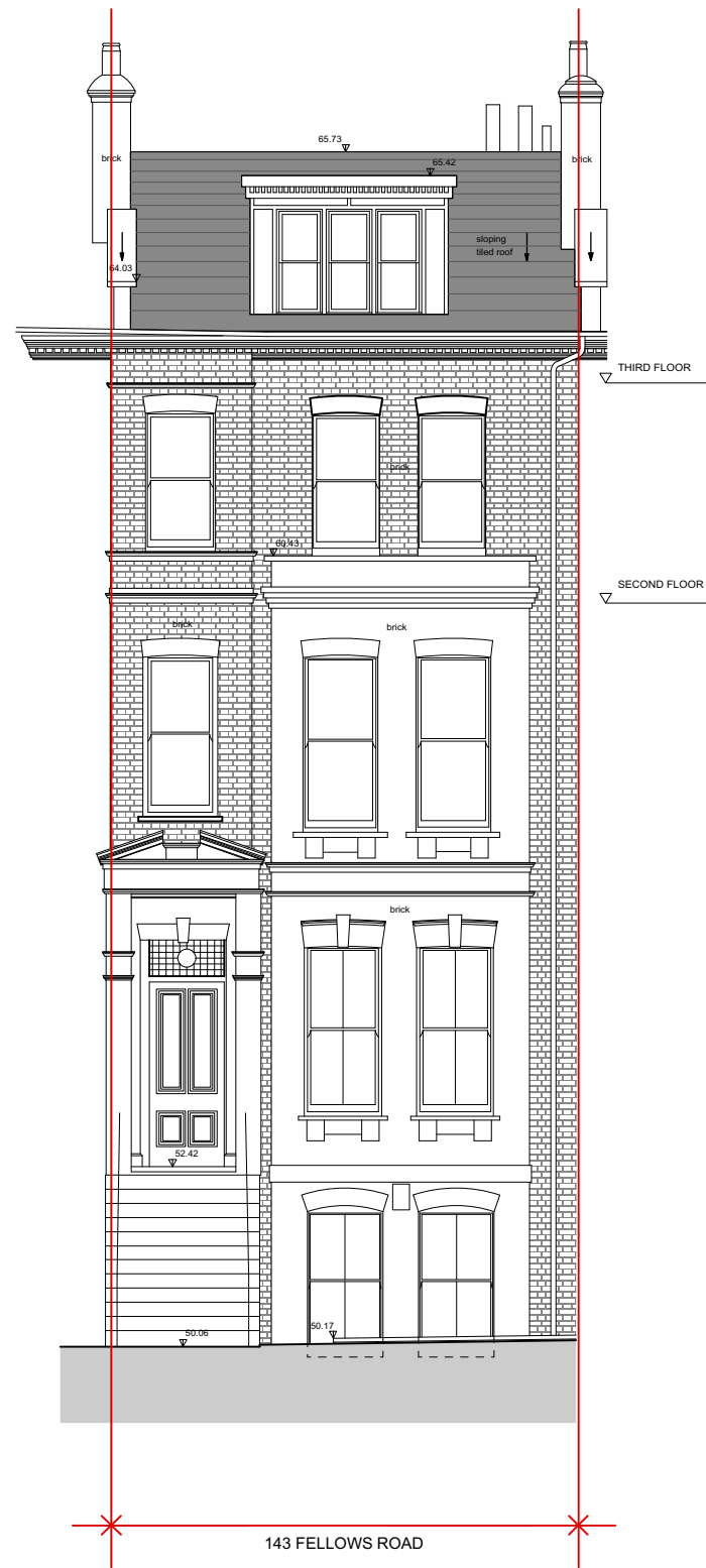
01 Existing Front Elevation Scale: 1:100