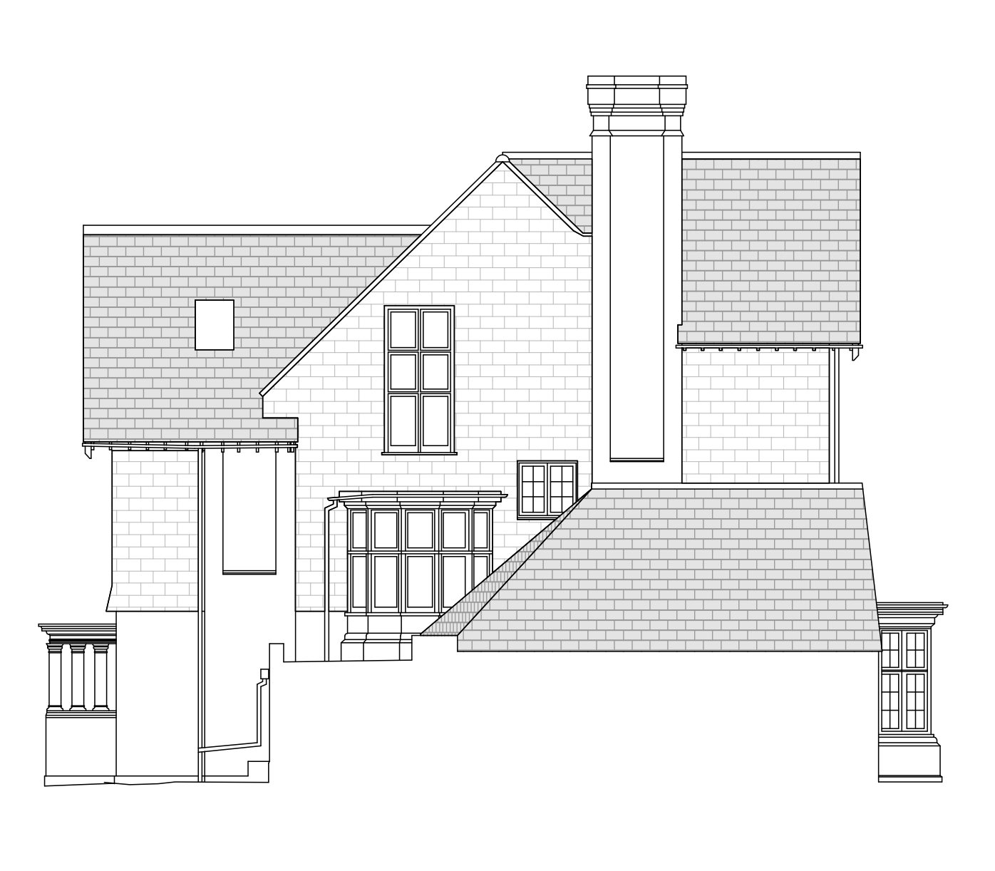
Datum: 98.00m. Existing Side Elevation 2