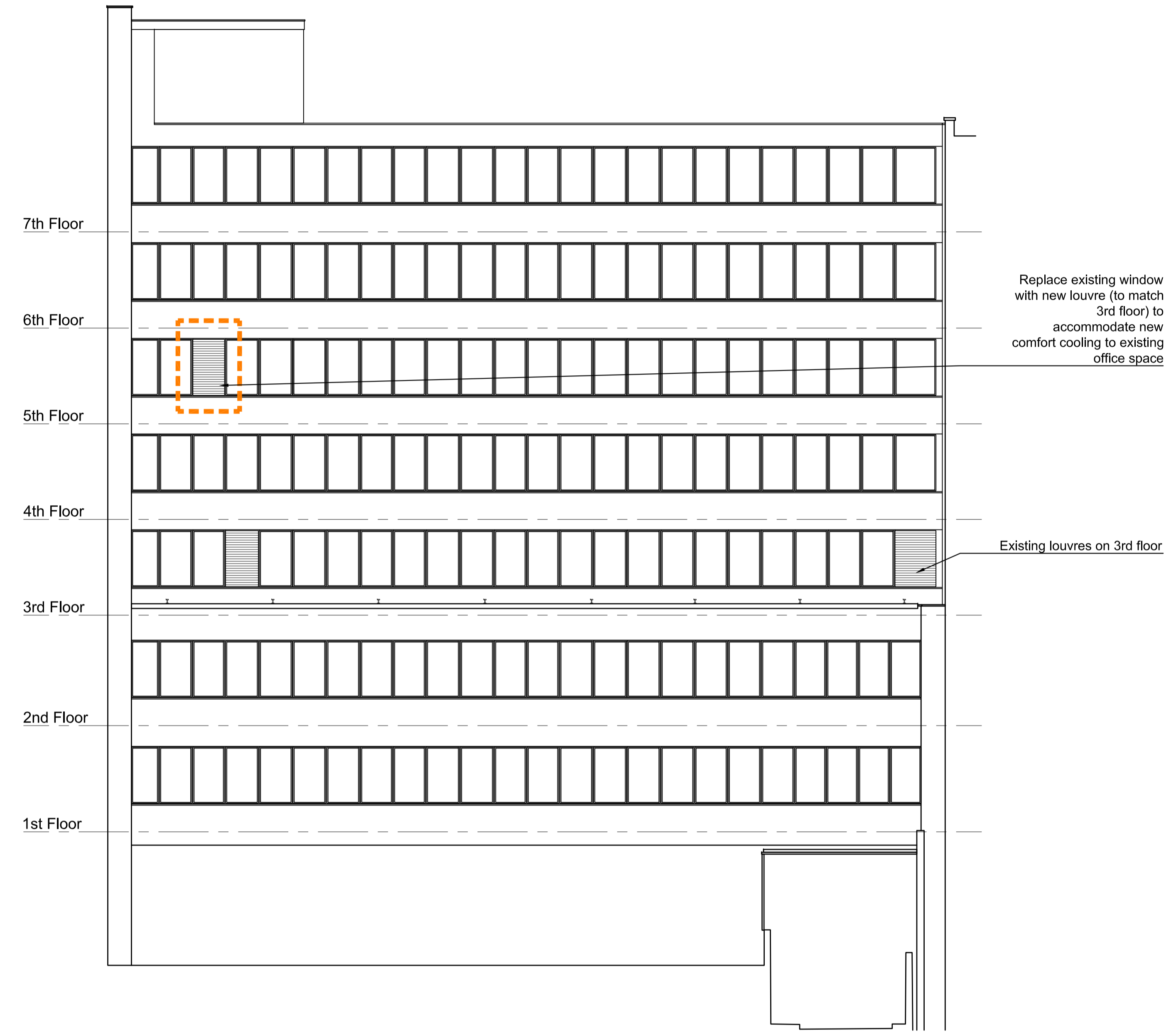
02 Existing Elevation A Scale 1:100