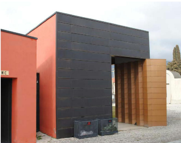
Cemetery in Trescore Balneario (BG), Italy

TECU® Oxid Weathering process (preliminary documentation)