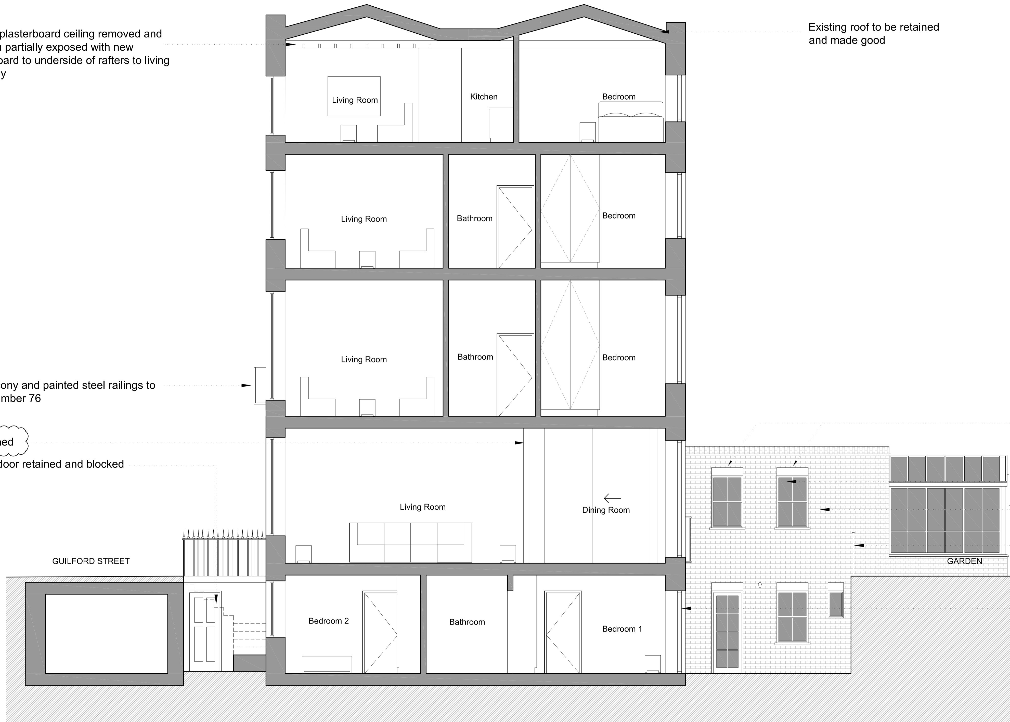
02 Section BB

New hardwood french doors and sidelights