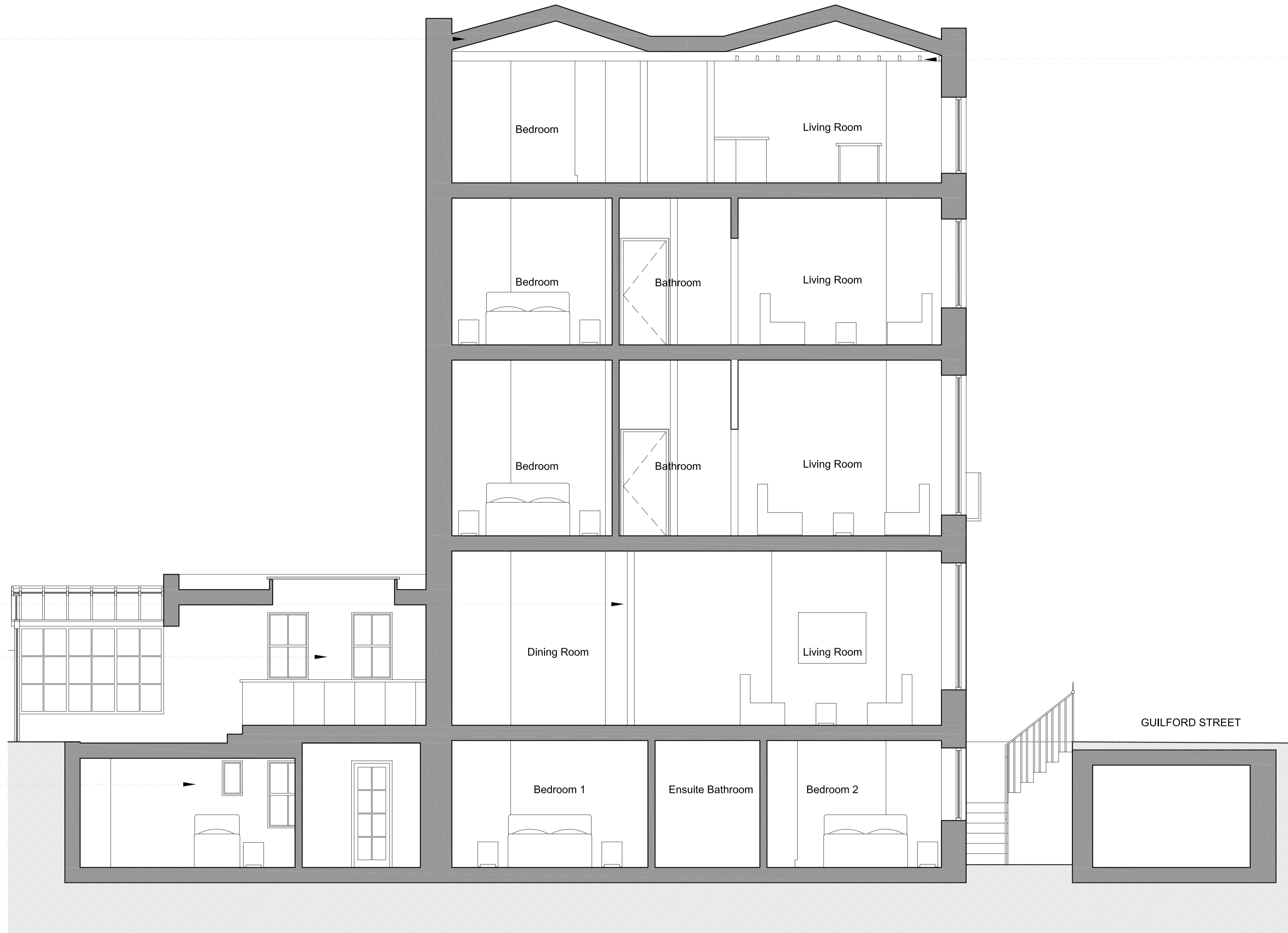
01 Section AA