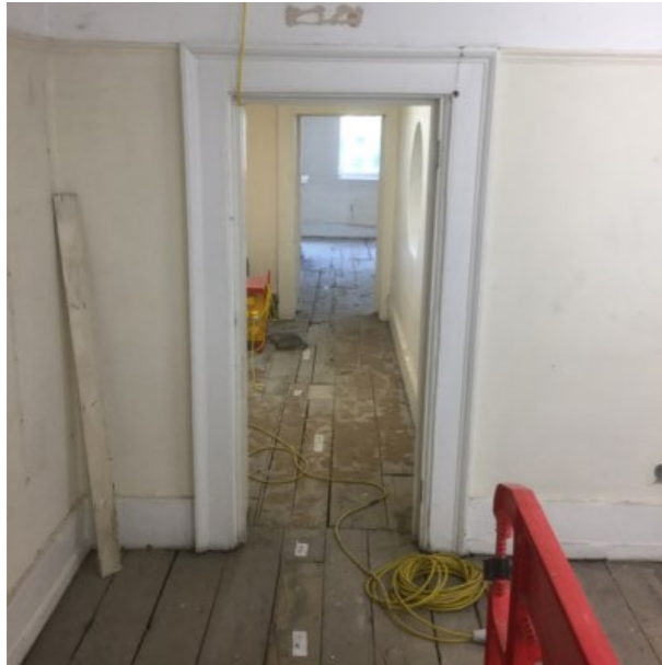
Inside Holes in top of architrave