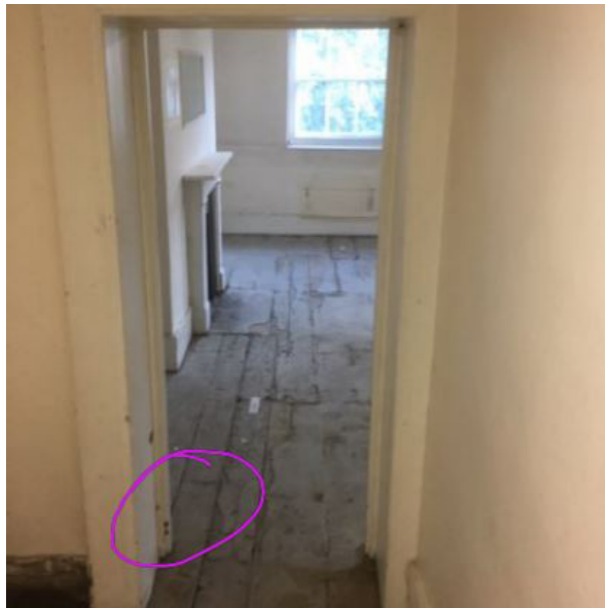
Inside Holes in frame