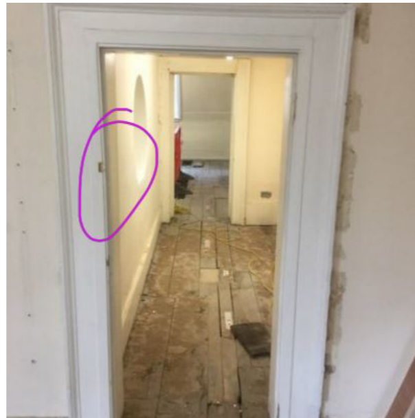
Outside Holes in architrave