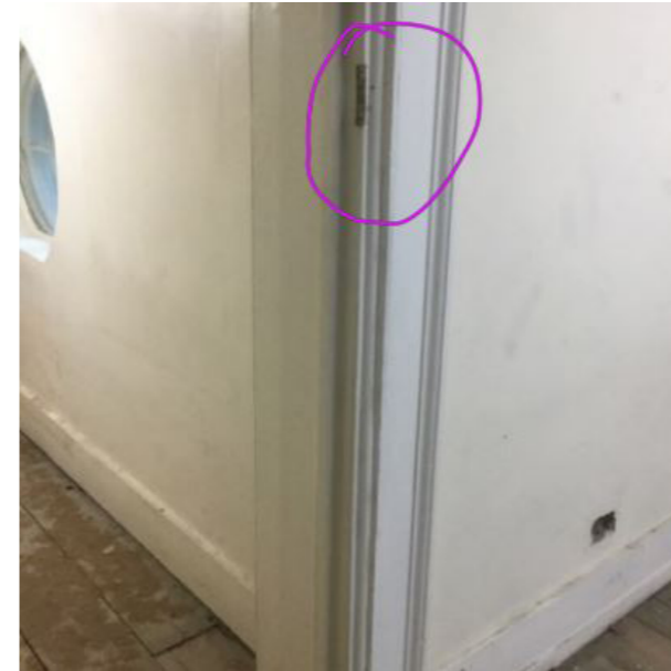
Open Holes in frame