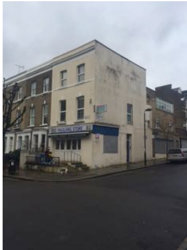
PH2 - Front and side view.