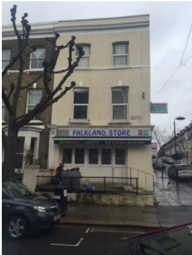
PH1 - Front view of 71 Falkland Road.