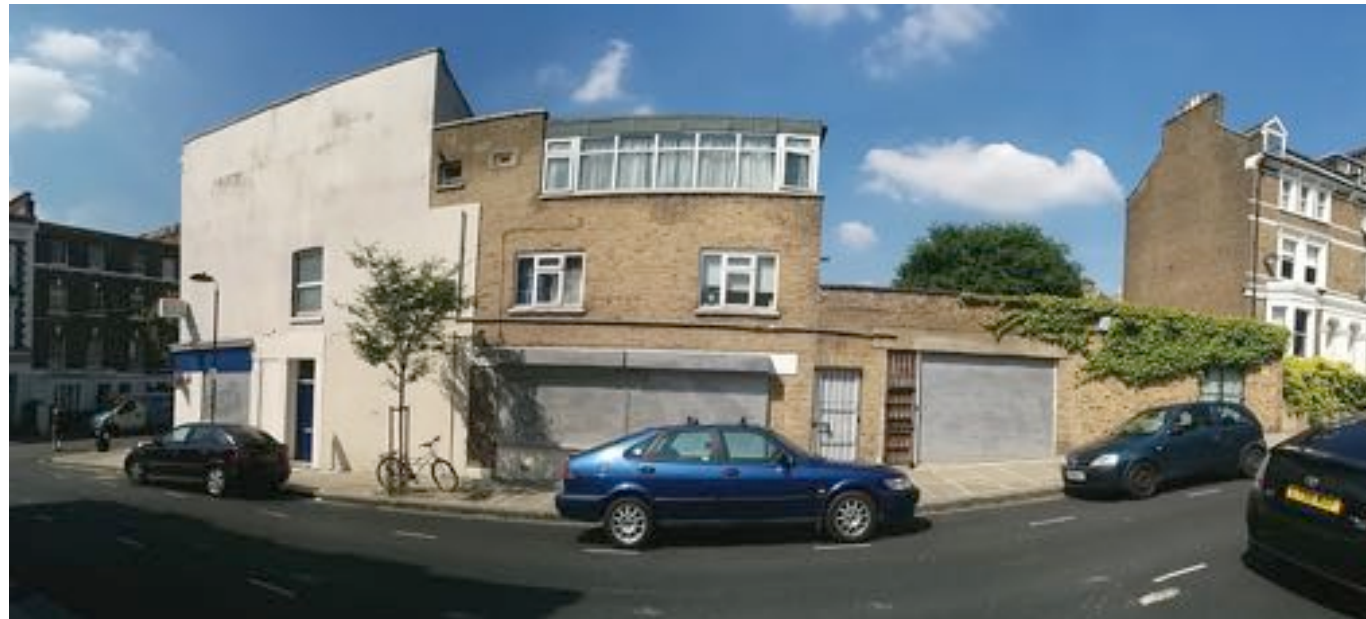
PH5 - Panoramic side view from Montpellier Grove.