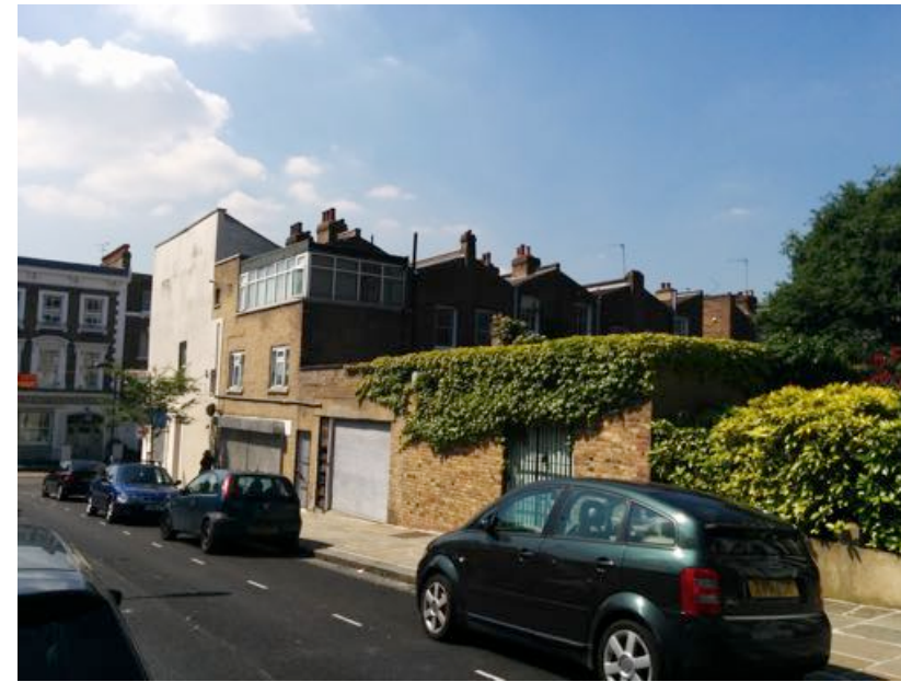
PH3 - Side and rear view from Montpellier Grove.