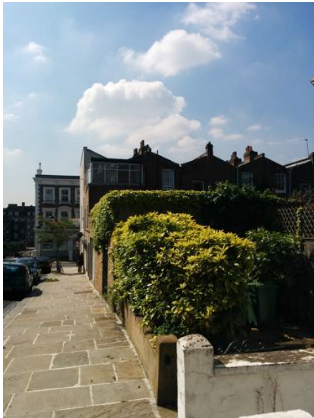
PH4 - Rear view from Montpellier Grove.