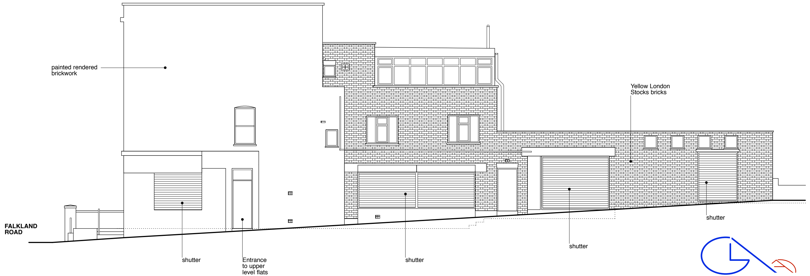
EXISTING SIDE ELEVATION FROM MONTPELIER GROVE