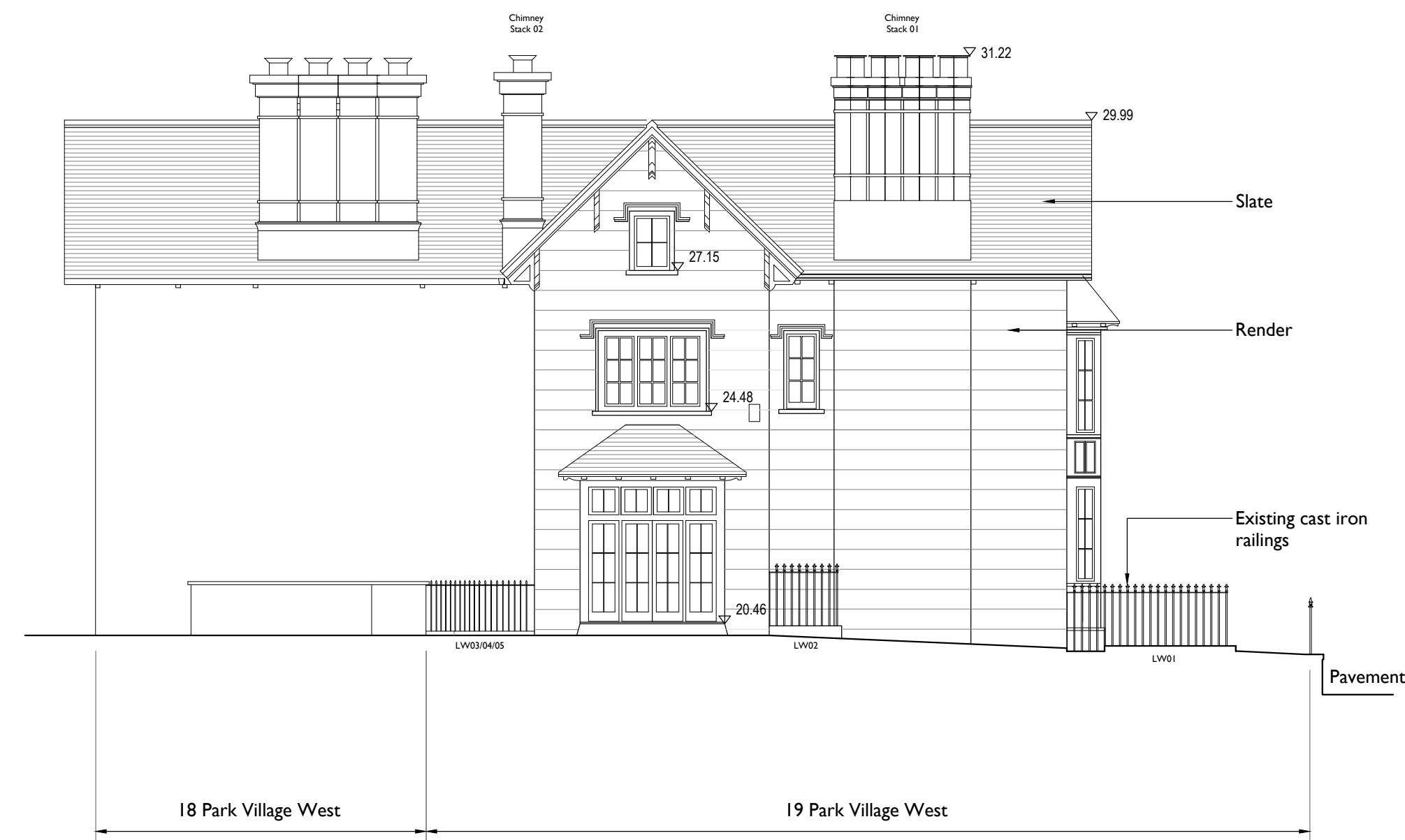
04 NORTH WEST ELEVATION AS PROPOSED 201 1:100