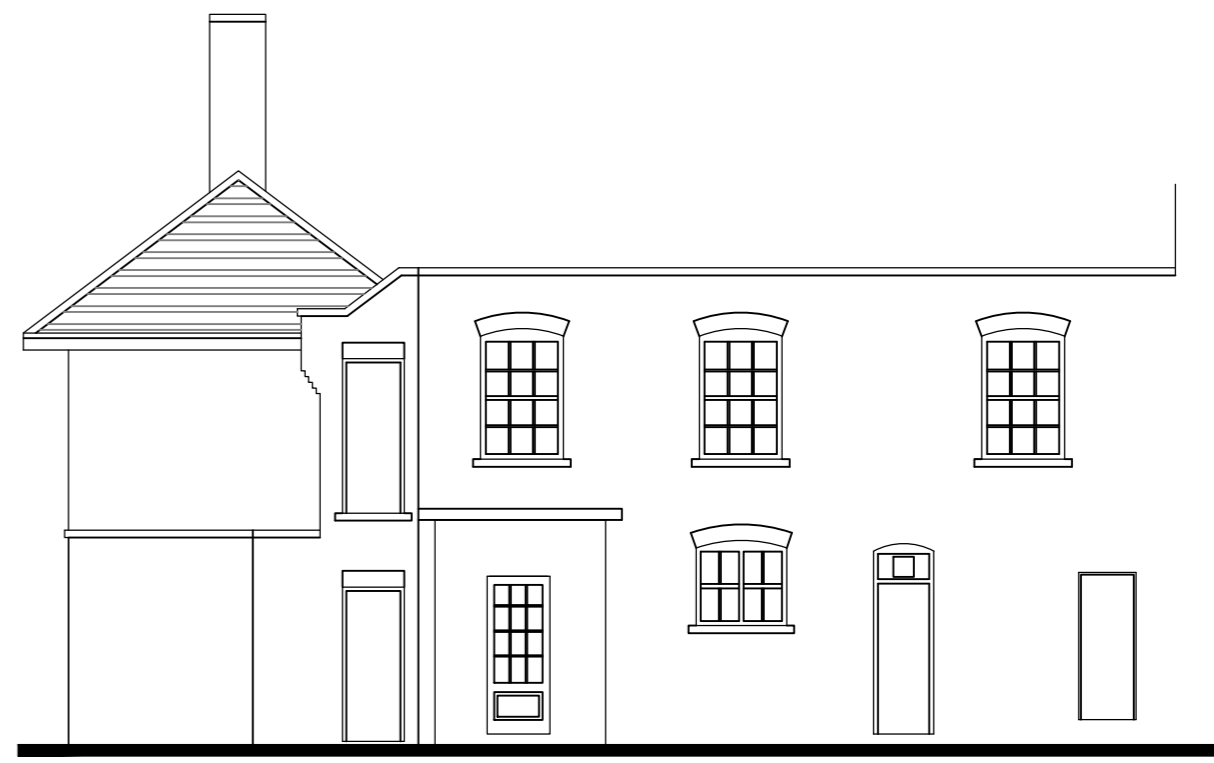
ELEVATION TO NORTH END

Lanterns to Entrances to be replaced with Elstead Lighting copper Lantern ref CS2 (530Hx250Wx400P) .