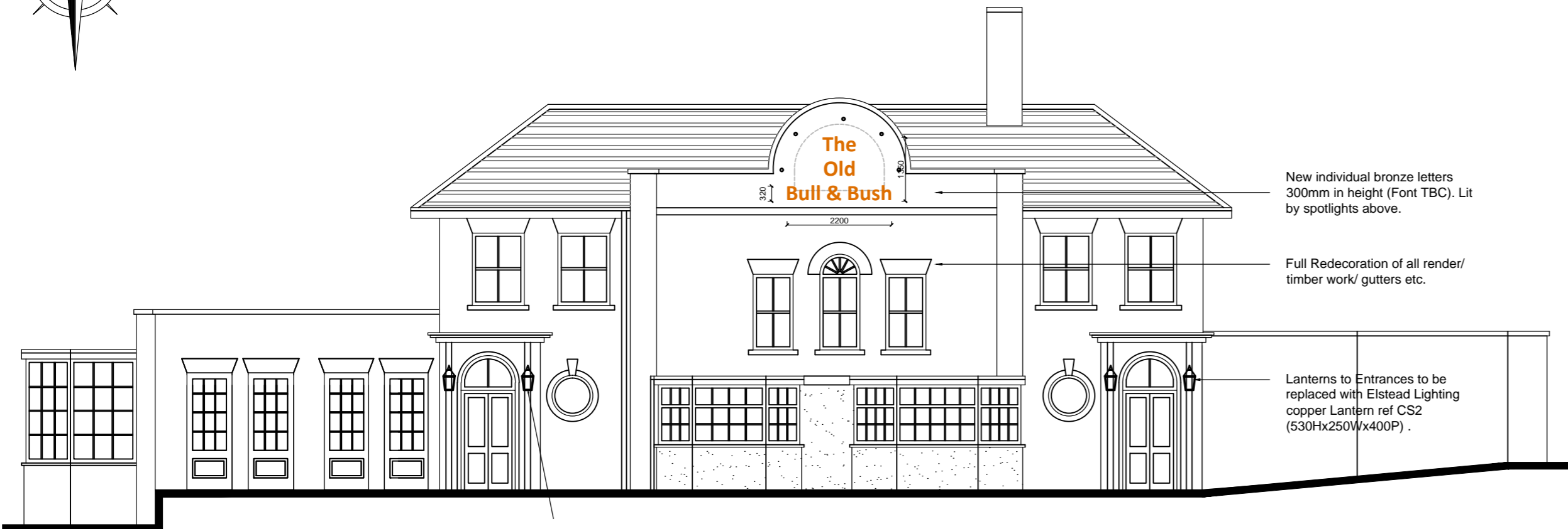
ELEVATION TO NORTH END WAY

Lanterns to Entrances to be replaced with Elstead Lighting copper Lantern ref CS2 (530Hx250Wx400P) .