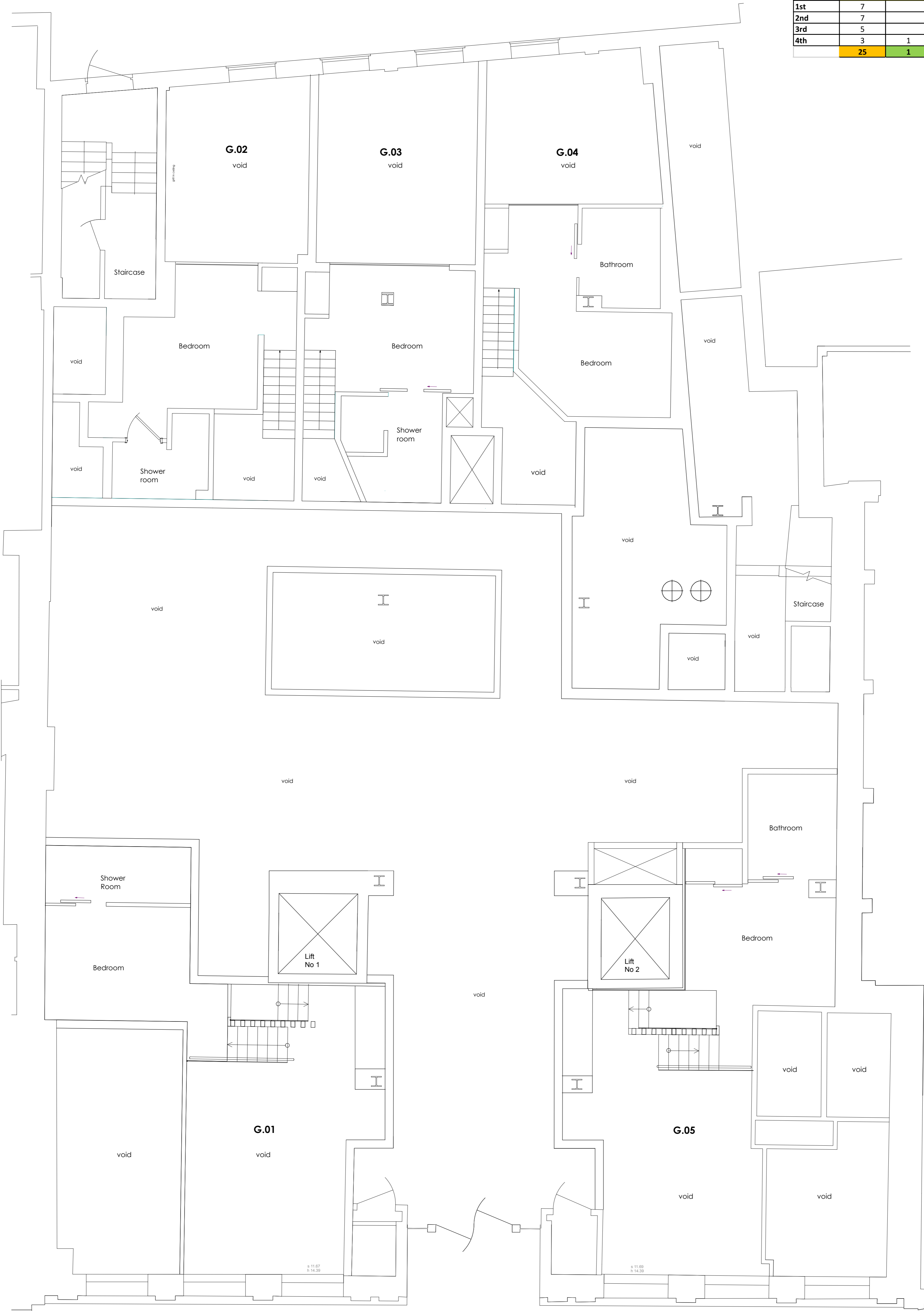
Mezzanine Floor Plan Scale: 1:100m @ A3