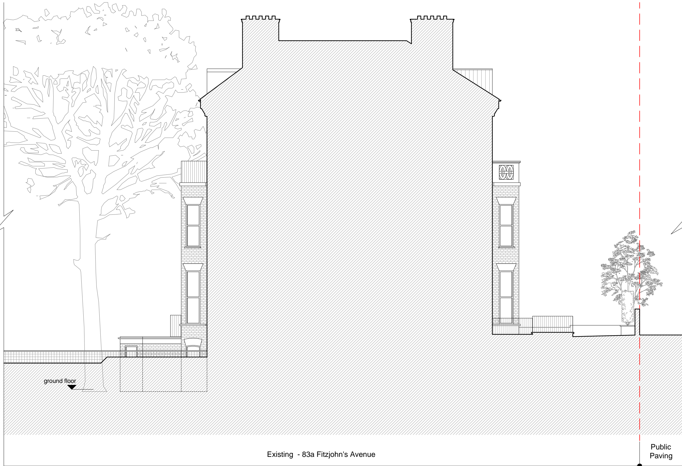
Existing - 83a Fitzjohn's Avenue