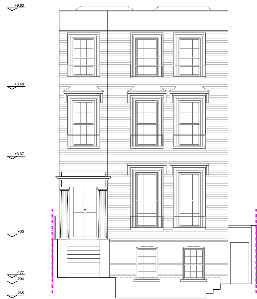
4.5 SOUTH-WEST ELEVATION 1503 EXISTING 1:100