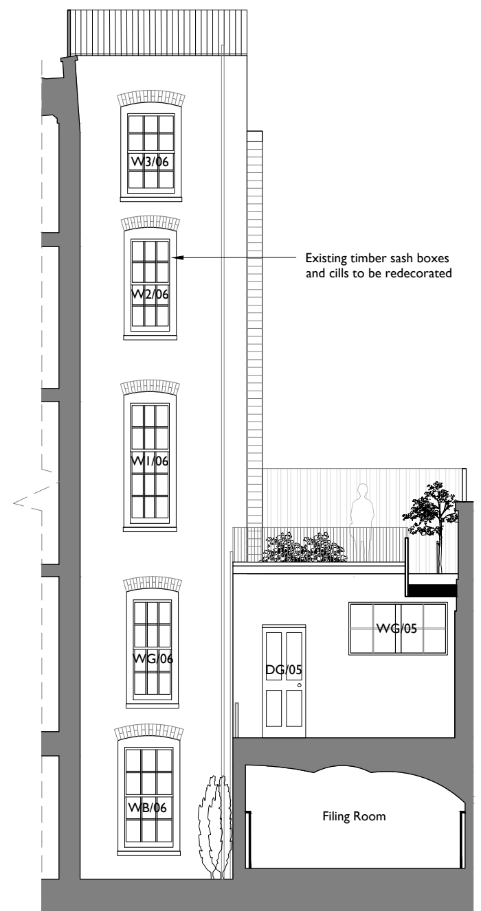
2 Proposed Side Elevation 220 1:100 @ A3