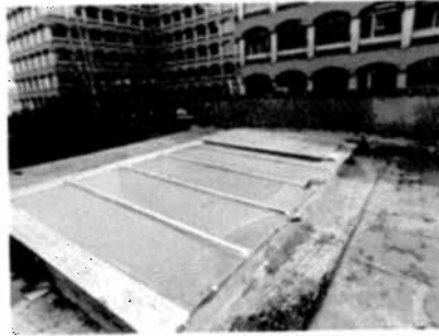
Metal single glazed rooflight