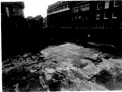
Asphalt flat roof