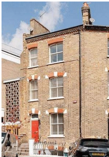
No10. Front Elevation

PART OF PROPERTY AFFECTED BY THIS APPLICATION