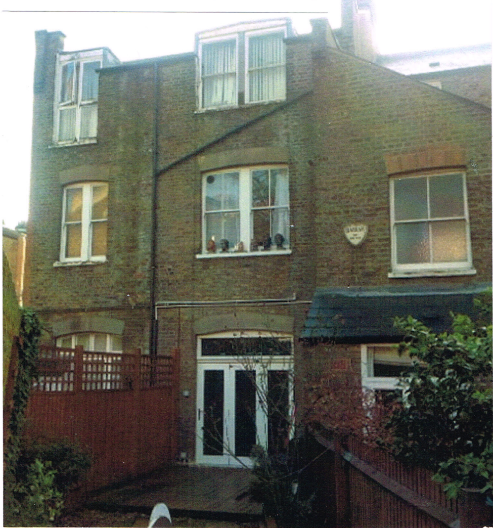
PHOTO 2 Render to Brick Arch Detail