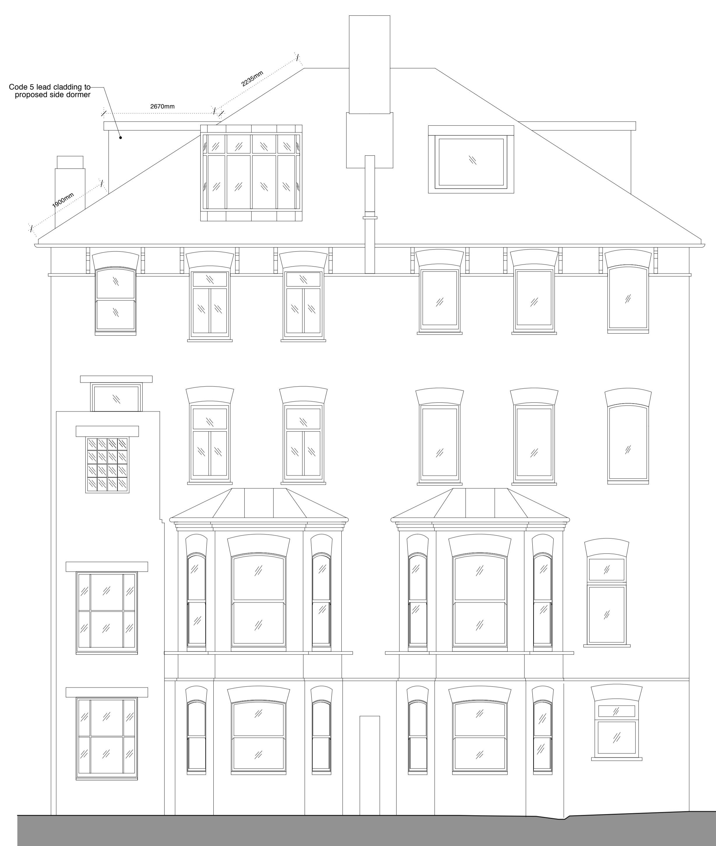
2 REAR ELEVATION PA1-005