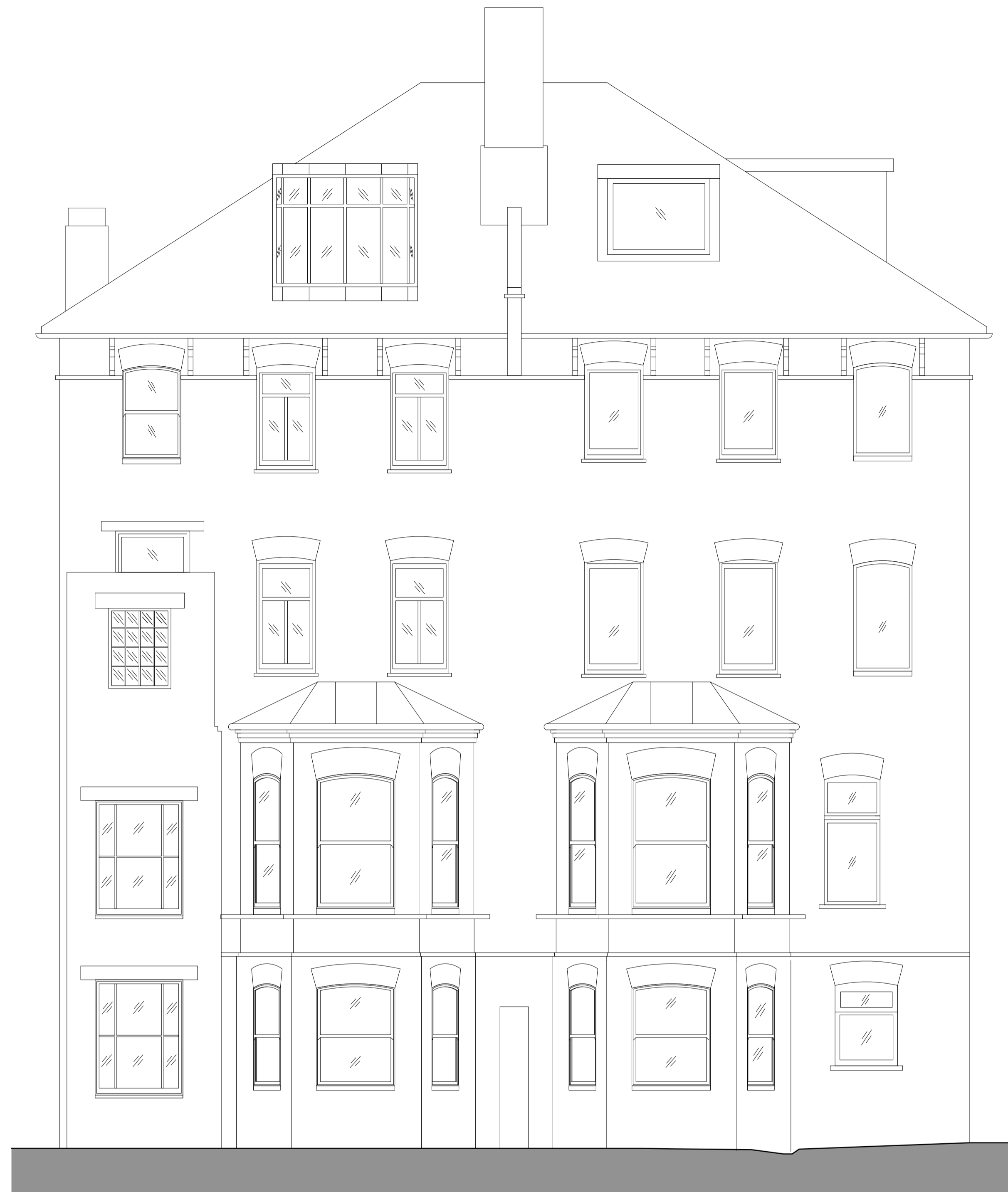
2 REAR ELEVATION