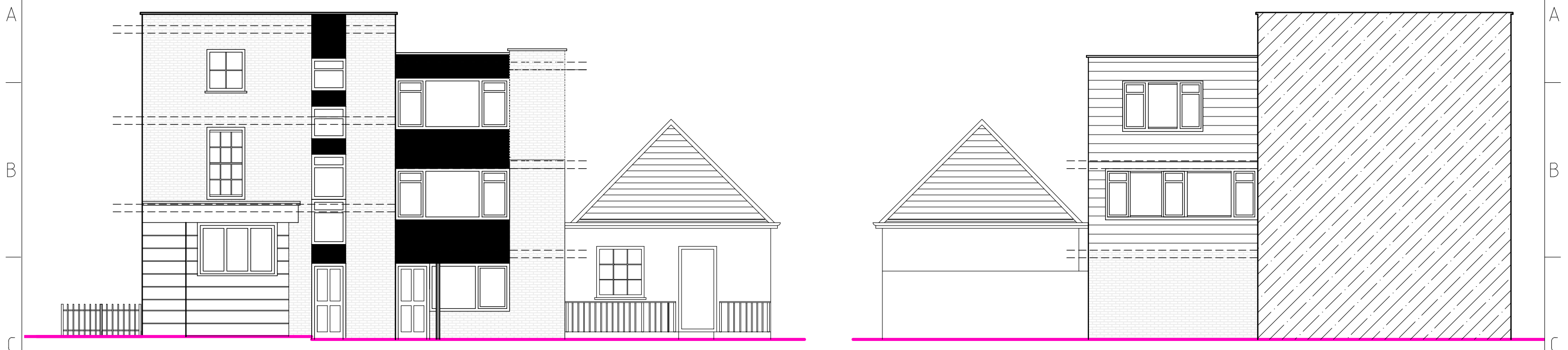
ALDENHAM STREET ELEVATION