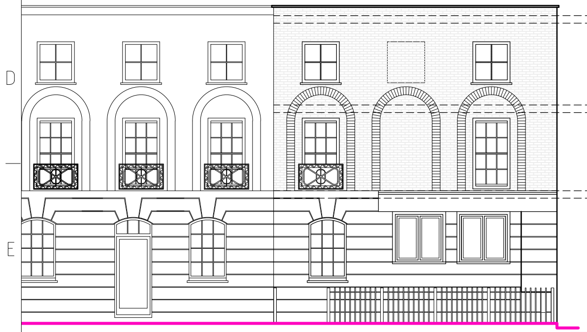
EVERSHOLT STREET ELEVATION