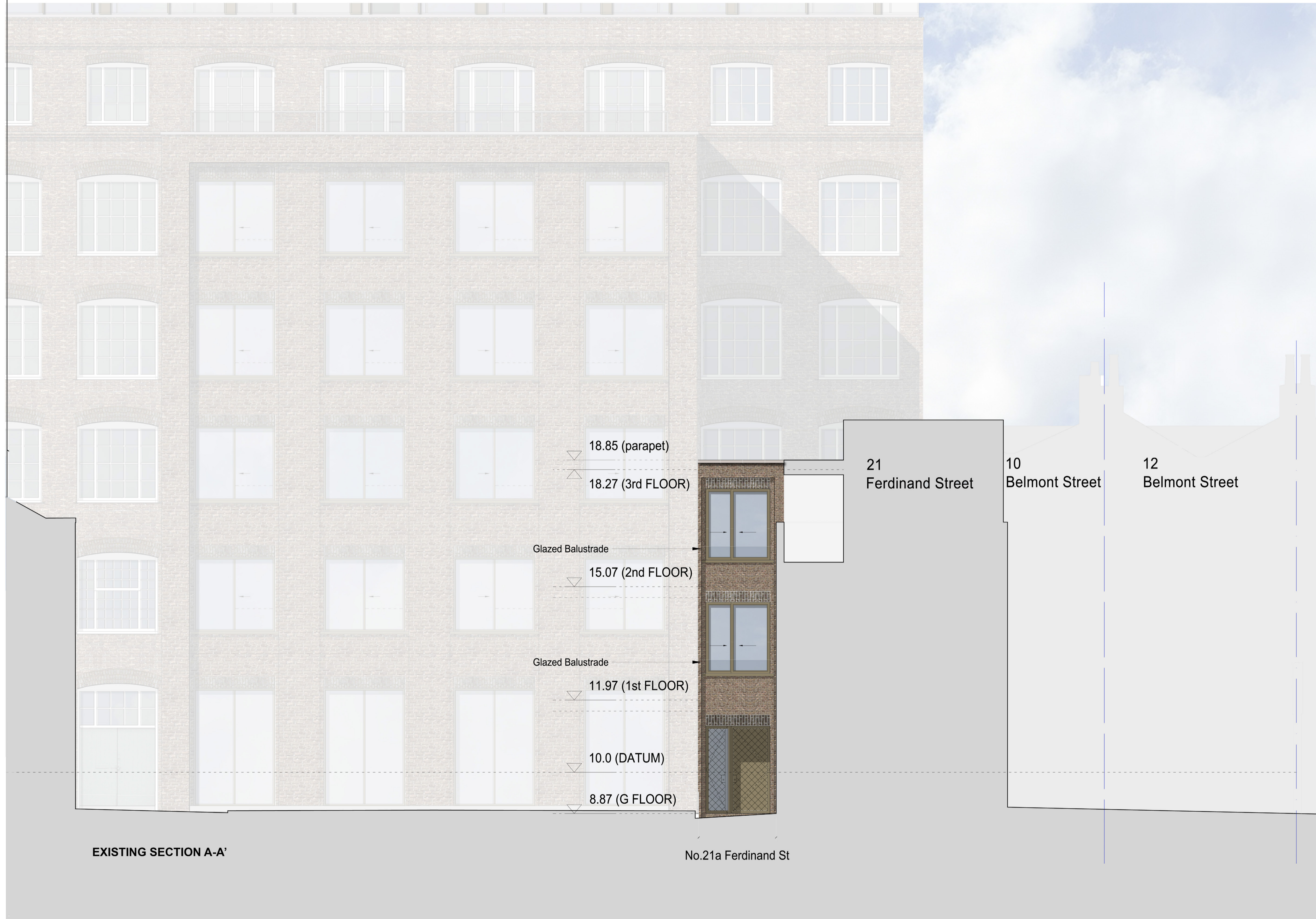
EXISTING SECTION A-A'