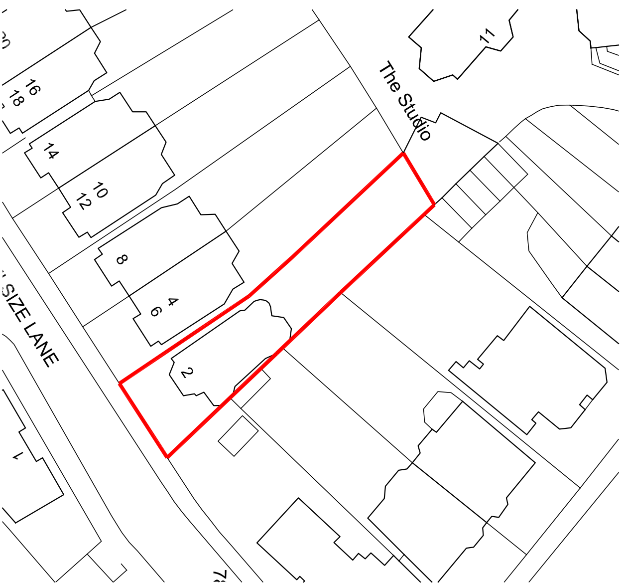
EXISTING Location Plan SCALE 1/5000@A3 LP-01