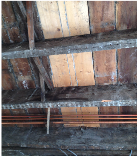
Modern floorboards to two locations