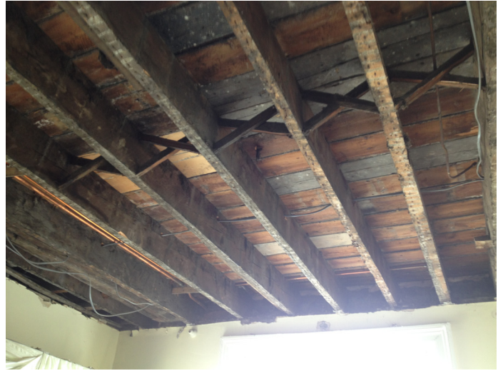
Two lines of herringbone strutting