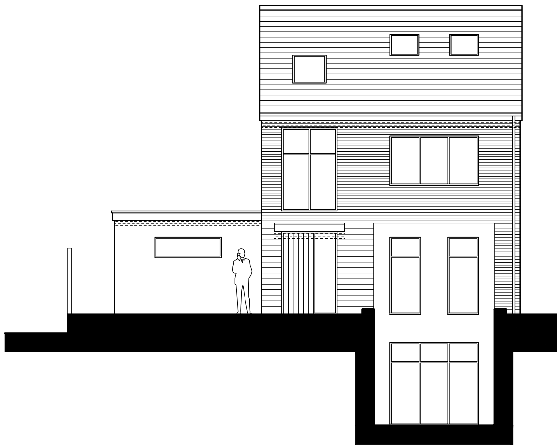
[01] Proposed Front Elevation 1:100