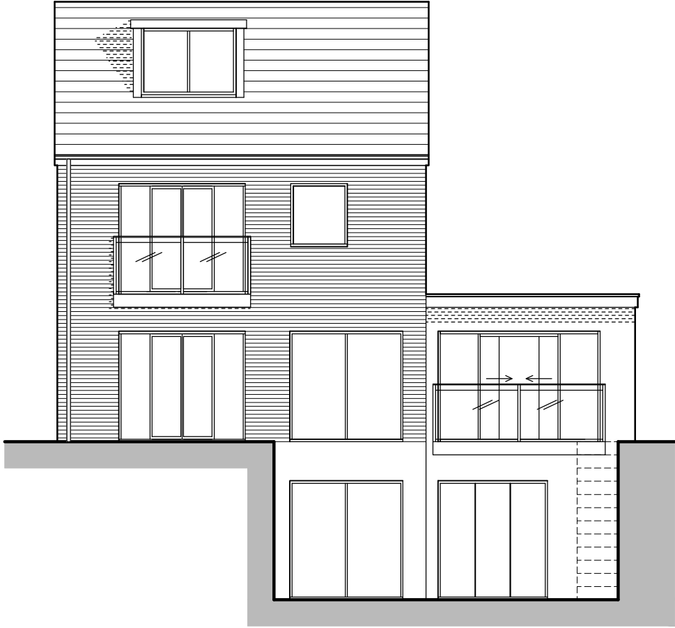
[01] Proposed Rear Elevation 1:100