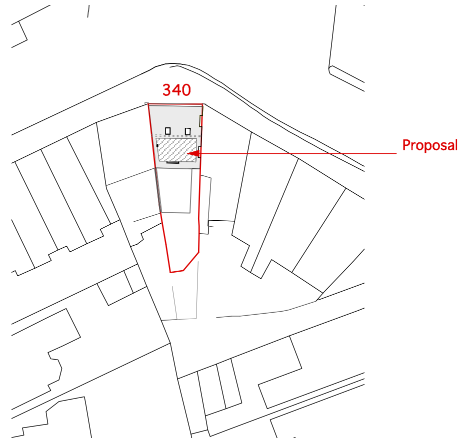
Proposed Block Plan 1:500

Job 340 West End Lane for Manuel Swaden Ltd Title Existing Location & Proposed Block Plans