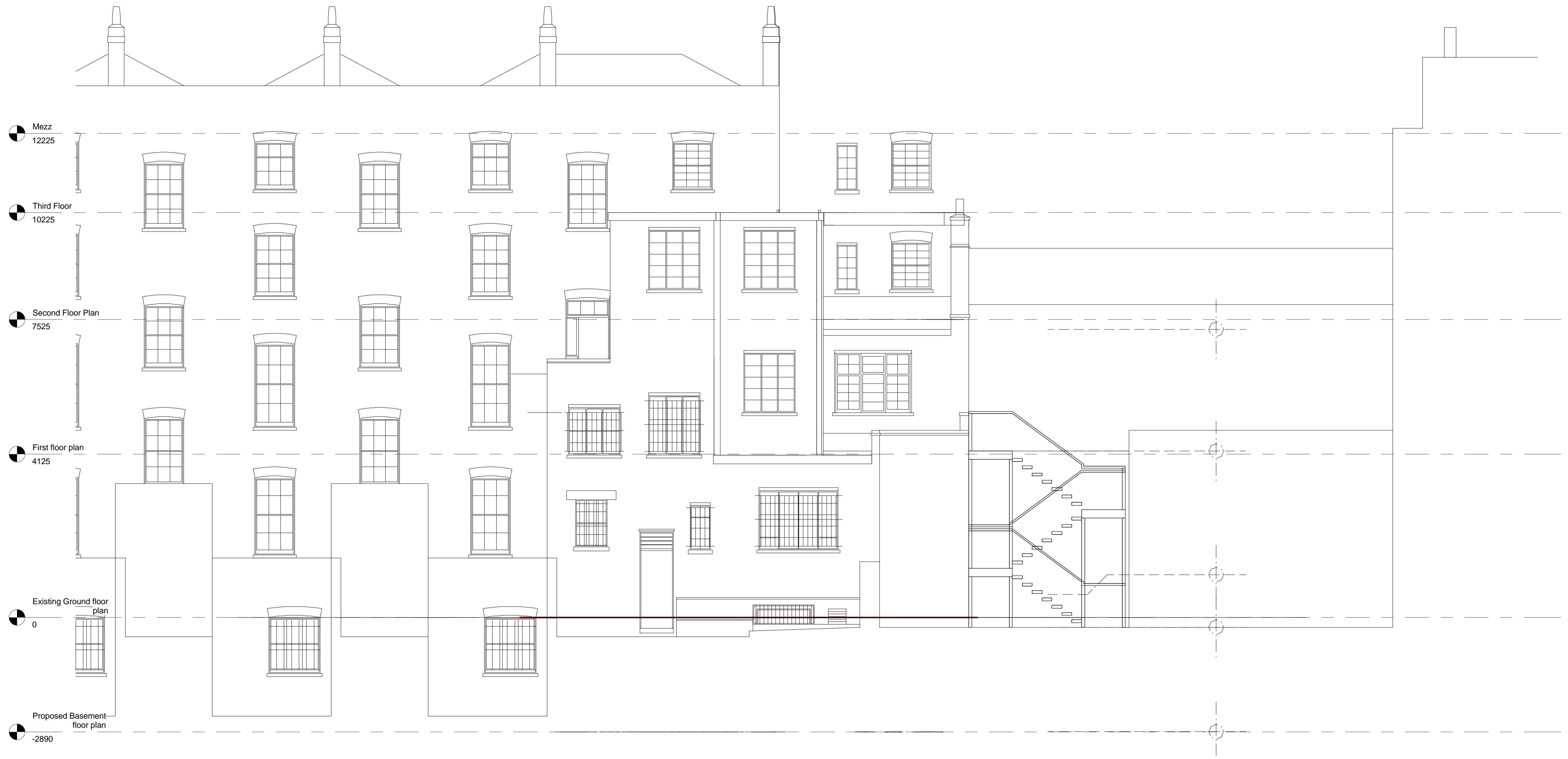
1 Existing Rear Elevation 1:50