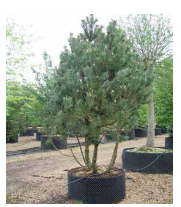
Tree: B Deepdale Code: 1989 height: approx 3-3.5m weight: approx 750kg