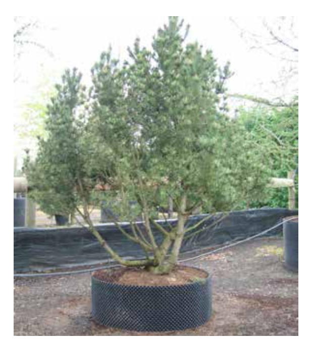
Tree: C Deepdale Code: 1990 height: approx 3-3.5m weight: approx 750kg