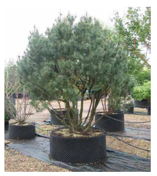
Tree: A height: approx 3m