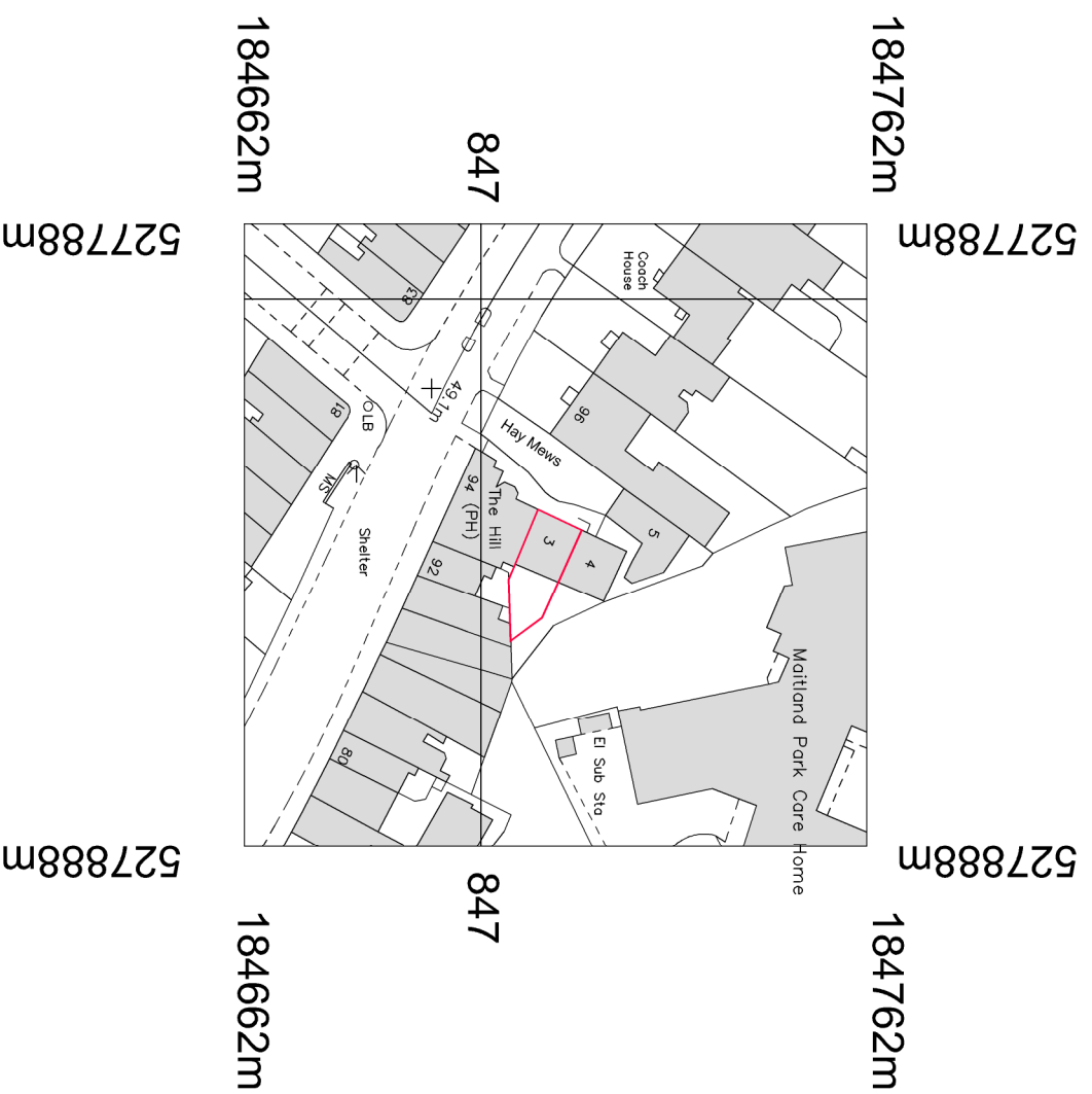
Site Location Plan: 1:1250 @ A3