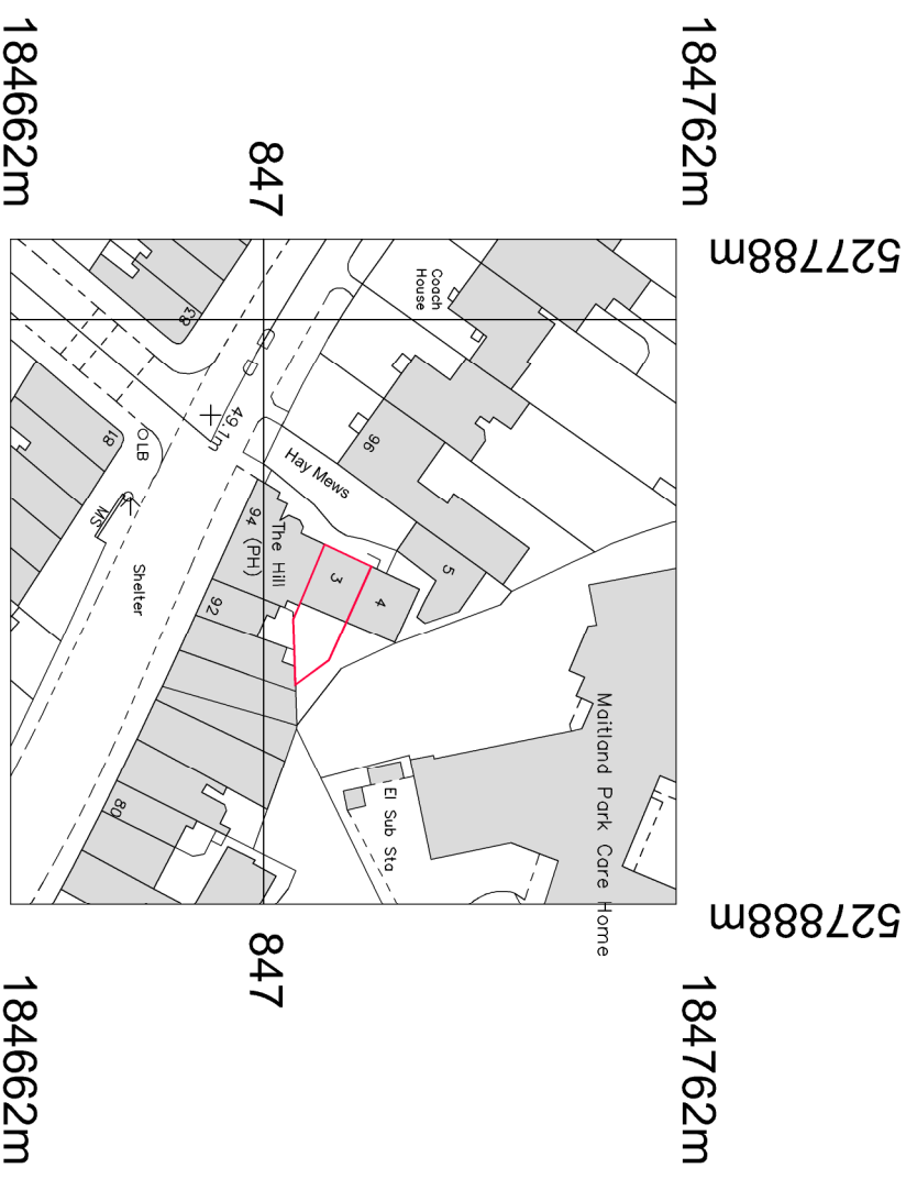
Site Location Plan: 1:1250 @ A3