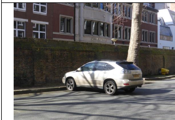
Fig 3 Existing Parking area opposite Raymond Buildings (No4) adjacent to Jockey's Fields boundary wall