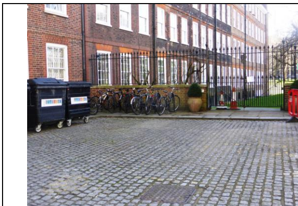
Fig 1 Existing Parking area to the South side of No1 Verulam Buildings adjacent to North wall of No9 Gray's Inn Square (Temporary recycling containers)