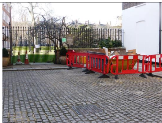
Fig 2 Existing Parking area to the South wall of No1 Verulam Buildings (temporary skip space)