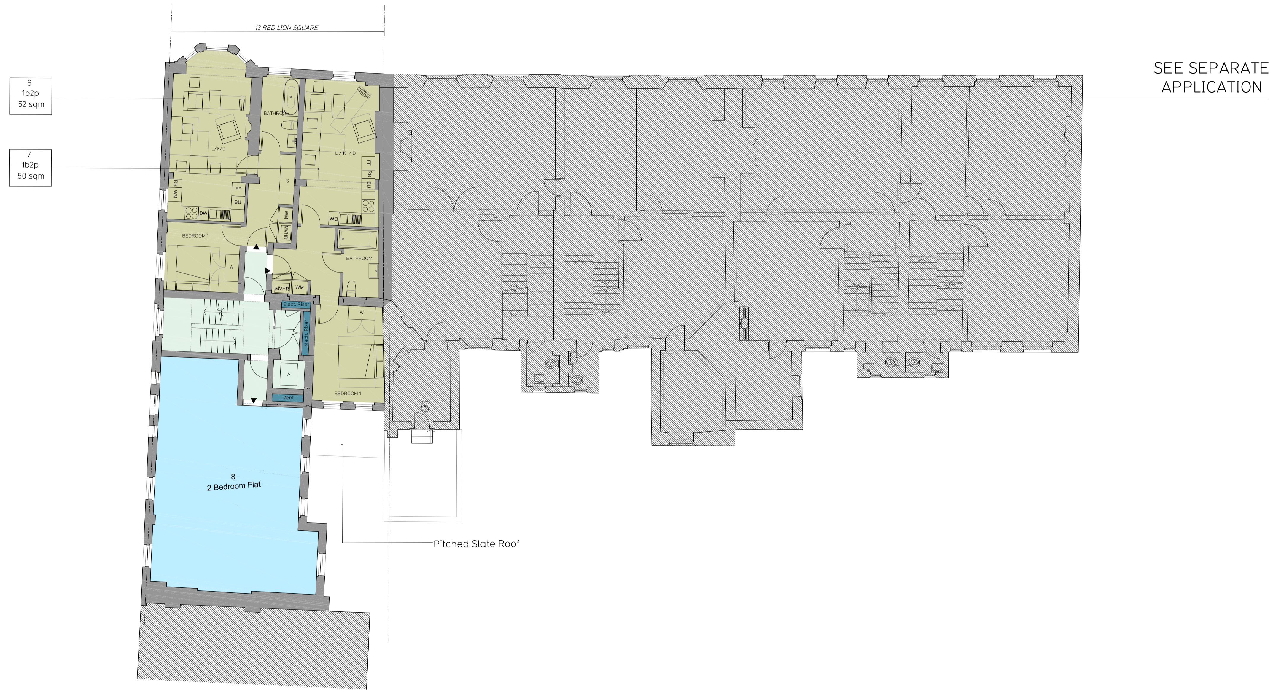
1 Proposed First Floor 112 SCALE 1:100