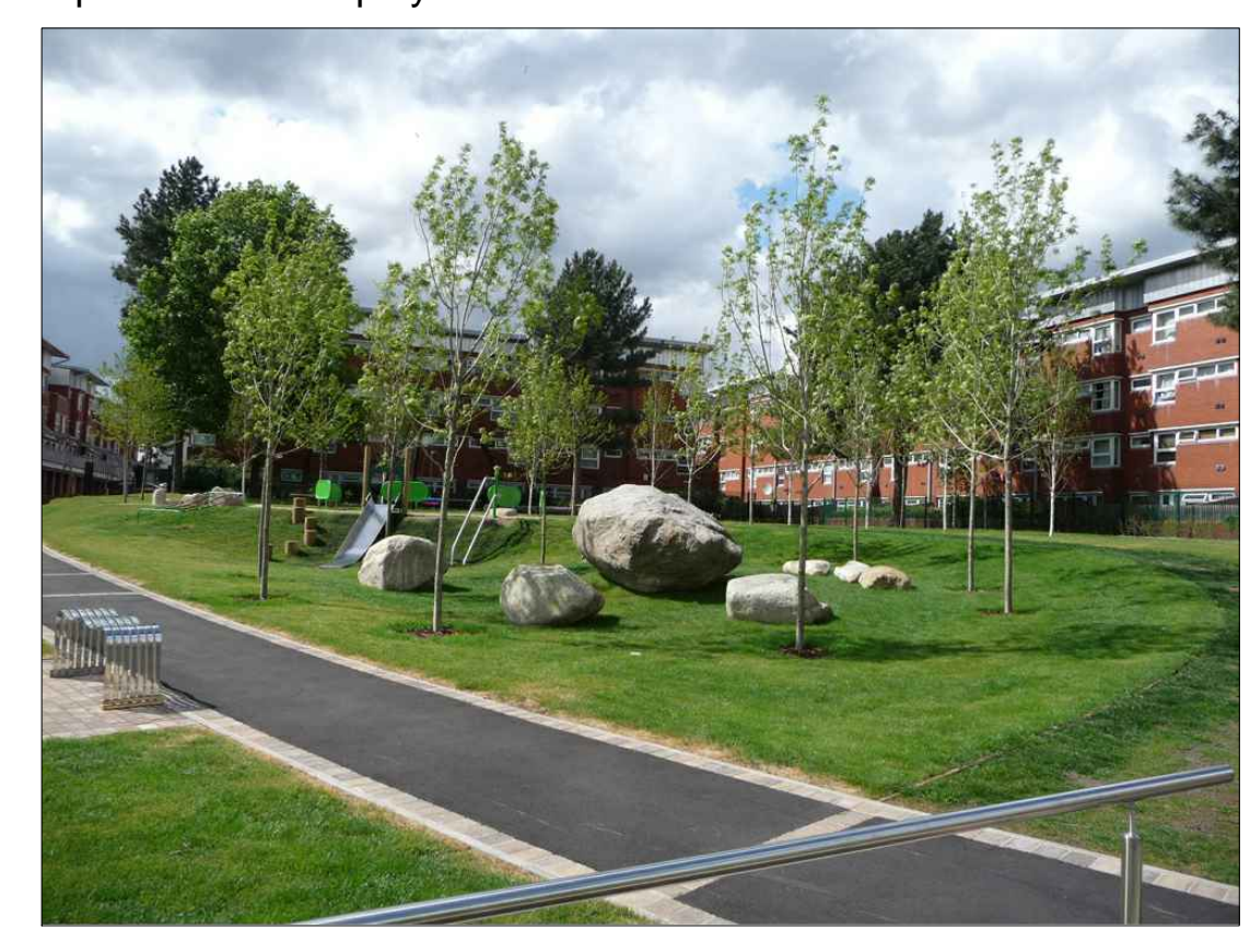
Proposed wooden sheep play sculptures