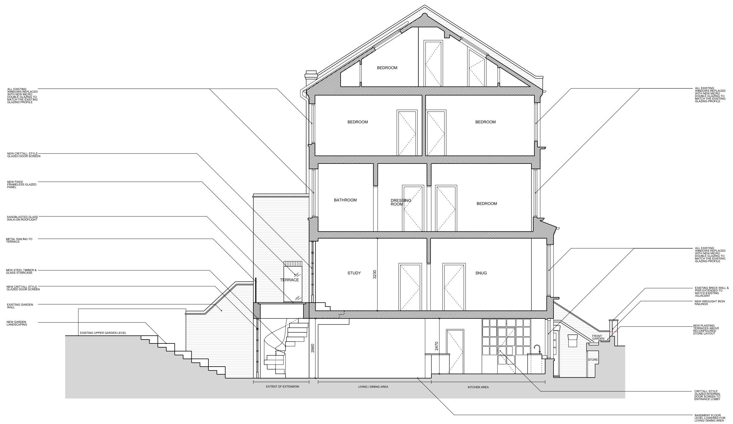
1 1:50 AT A1 PROPOSED CROSS-SECTION