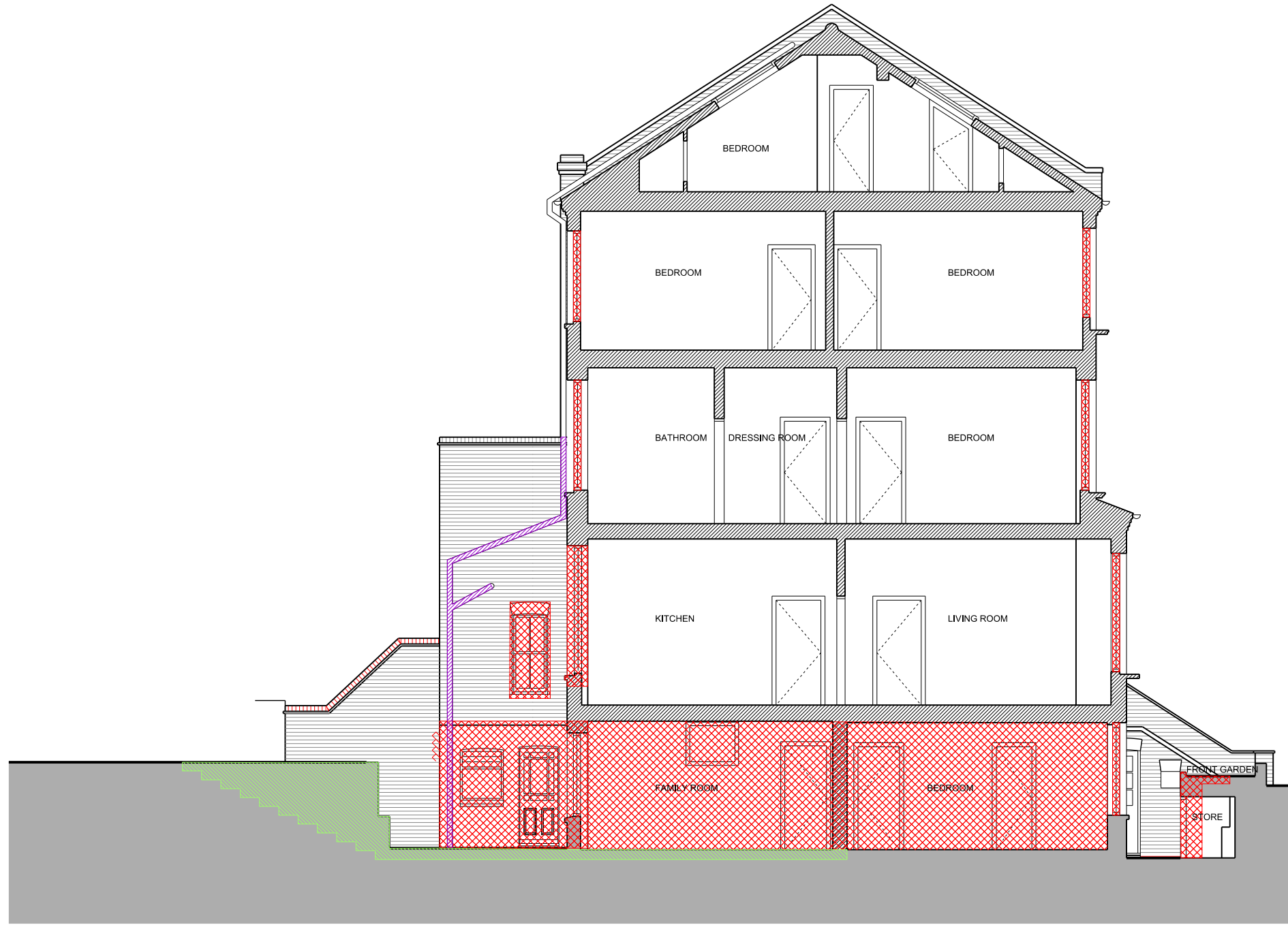
1 1:50 AT A1 EXISTING CROSS-SECTION