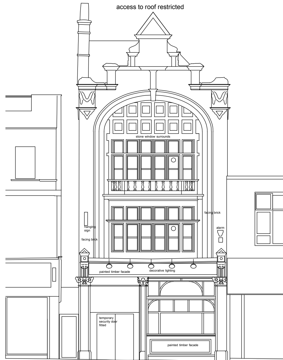
existing front elevation