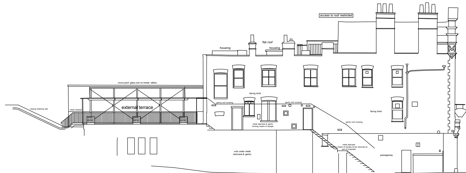
existing side elevation