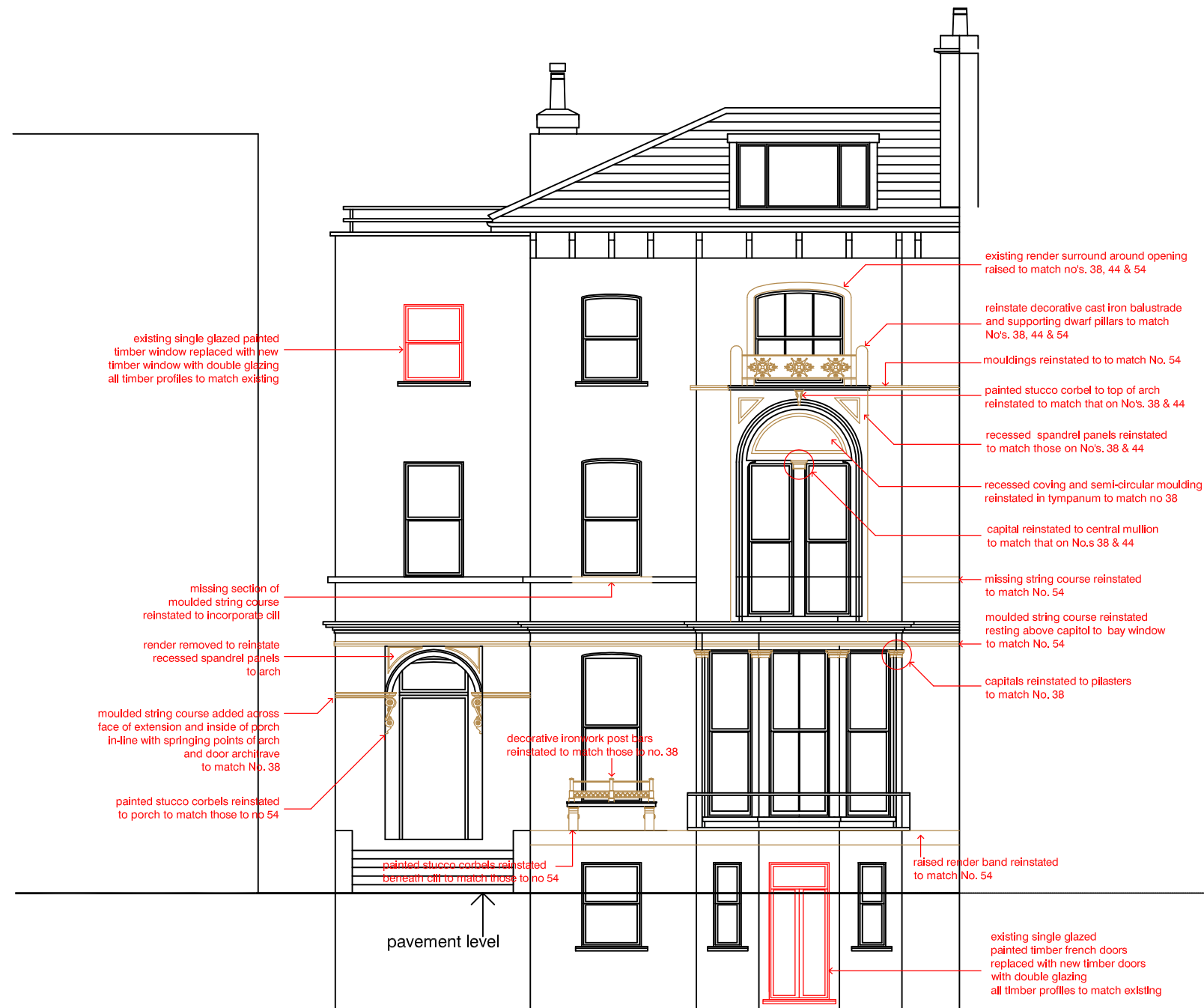
front elevation as proposed