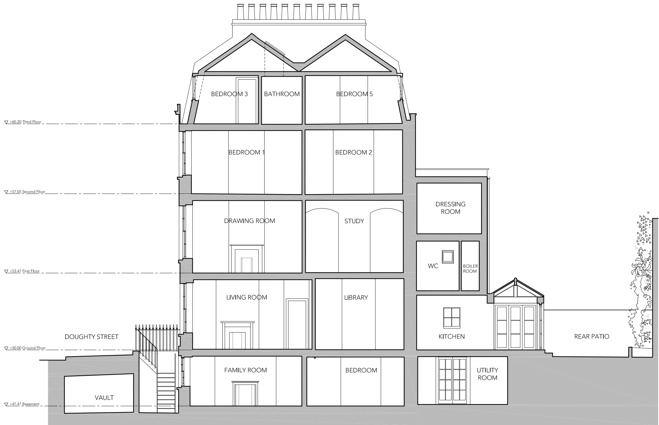
1 EXISTING SECTION AA scale 1:100

REVISIONS A PRE-PLANNING A PLANNING SUBMISSION DATE 18.09.2015 19.02.2016