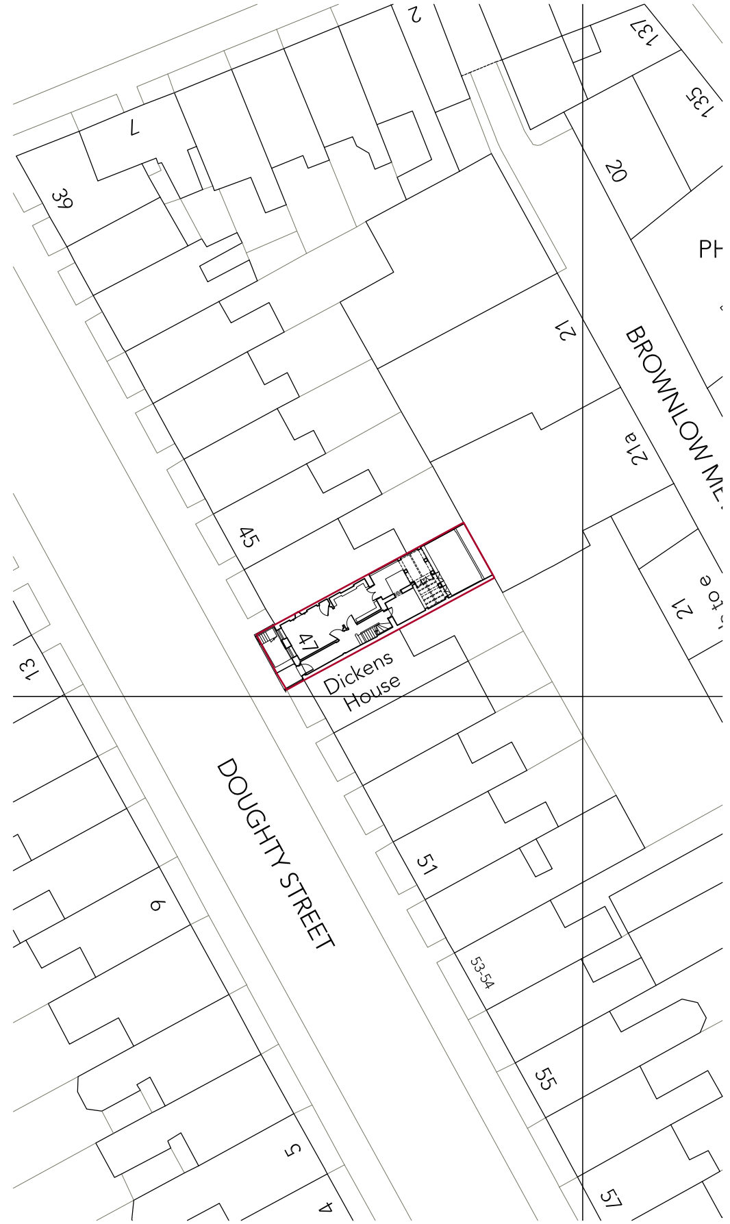
2 EXISTING SITE PLAN scale 1:500

NOTE DO NOT SCALE FROM THIS DRAWING, EXCEPT FOR TOWN PLANNING PURPOSES. THIS DRAWING IS THE PROPERTY OF TG STUDIO AND COPYRIGHT IS RESERVED BY THEM. THIS DRAWING IS ISSUED ON CONDITION THAT IT IS NOT REPRODUCED USED OR DISCLOSED BY OR TO ANY UNAUTHORIZED PERSON WITHOUT THE PRIOR CONSENT OF TG STUDIO. THE AREAS ON THIS DRAWING HAVE BEEN CALCULATED FROM A CAD DRAWING AND HAVE NO TOLERANCES ADDED OR SUBTRACTED.