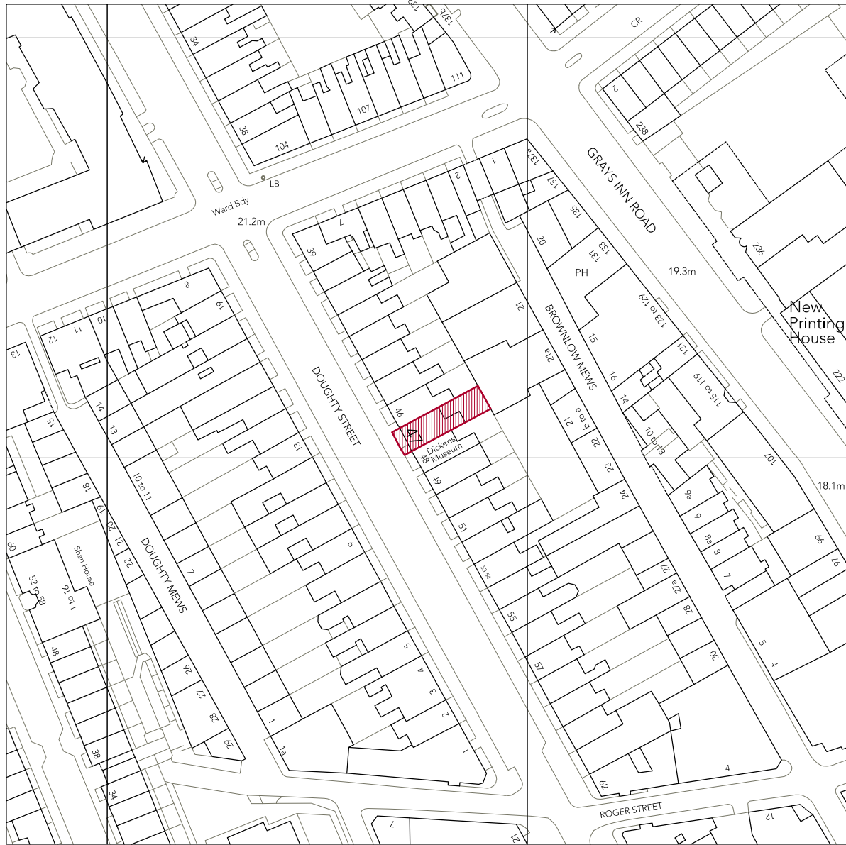
1 SITE LOCATION PLAN scale 1:1250