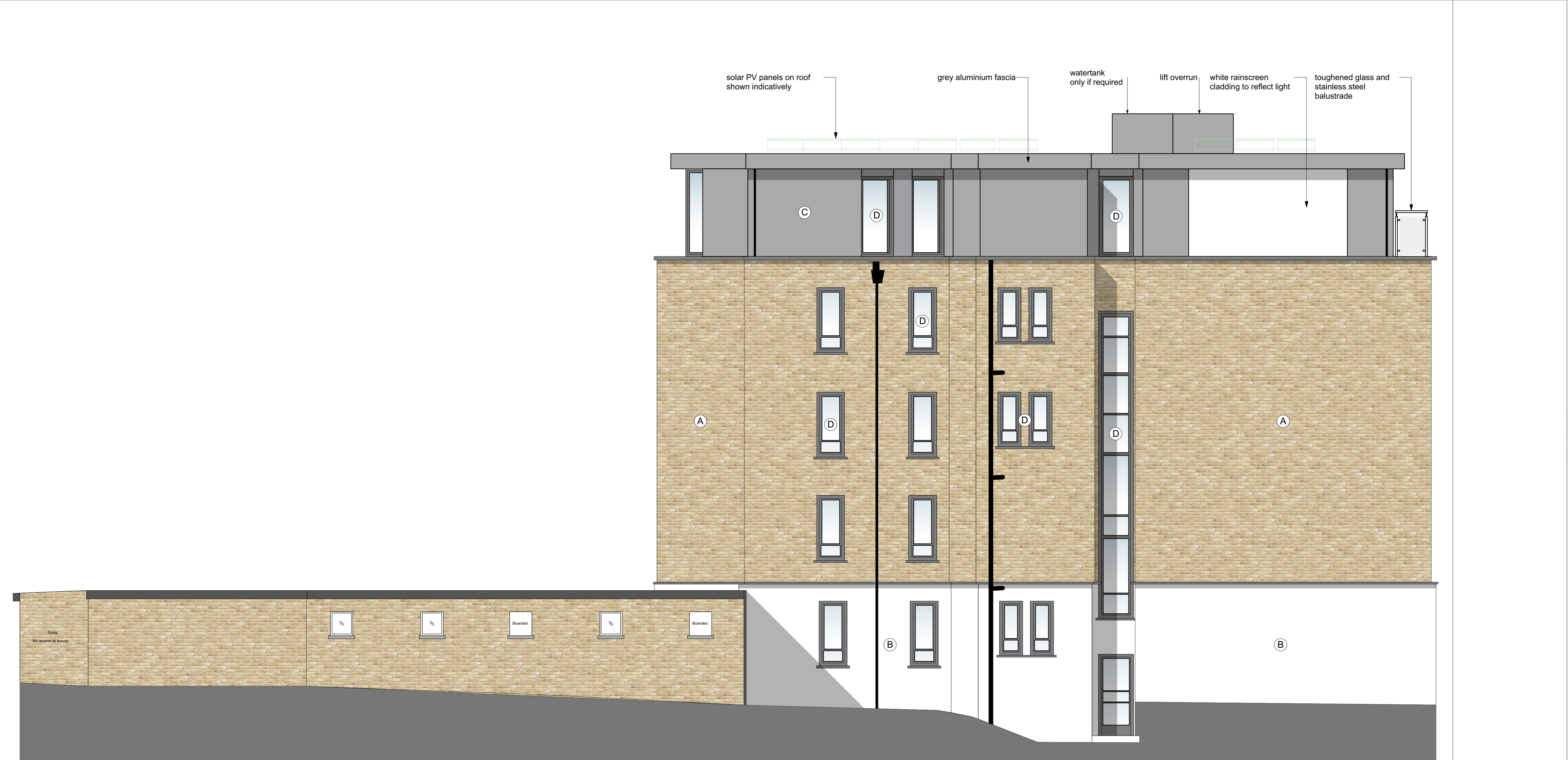
SYLVAN HOUSE, REAR ELEVATION