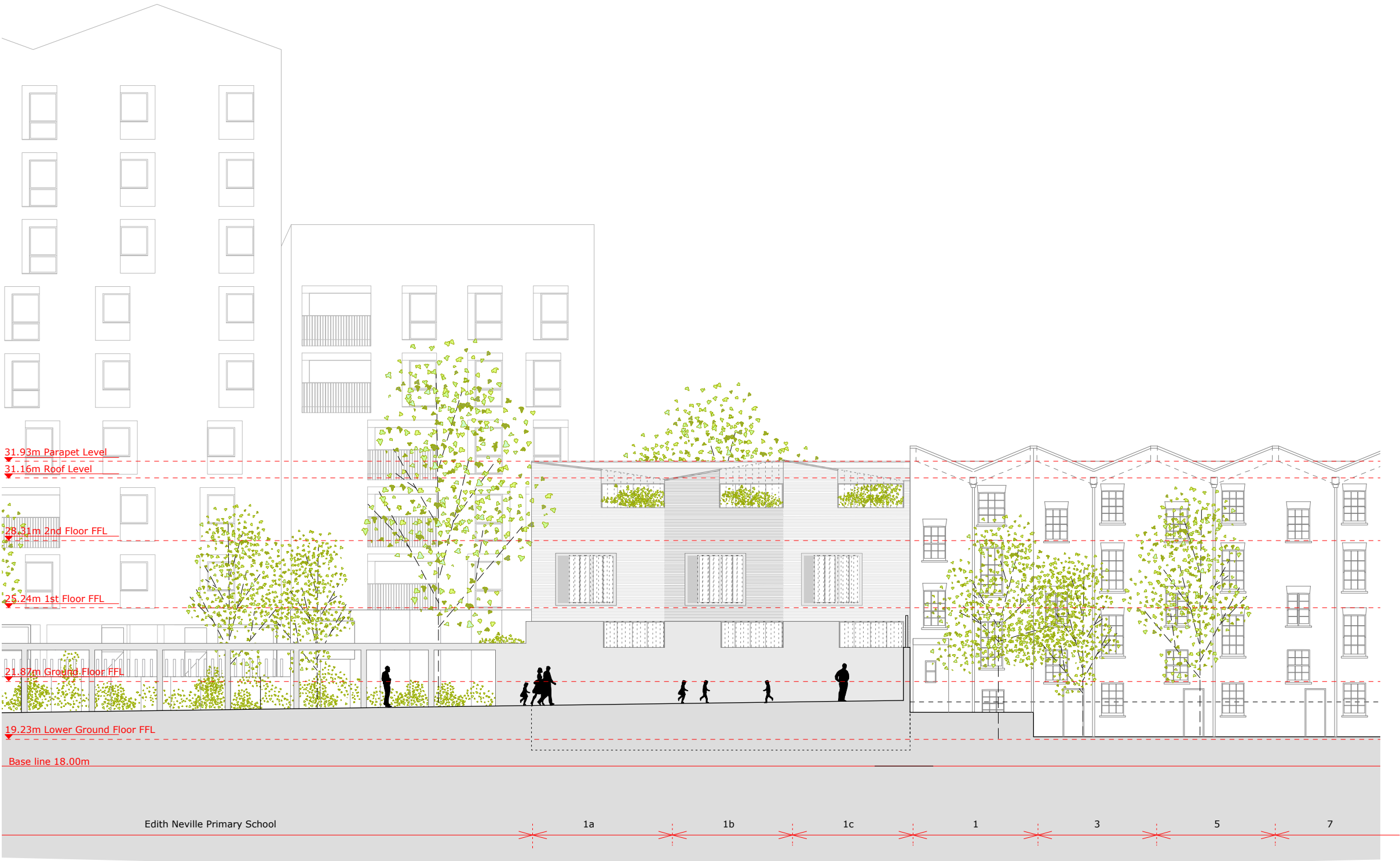
North East Elevation, Rear of Charrington Street 1:200

Check all dimensions on site. Do not scale off drawings without prior consultation. Any discrepancies to be reported to architects before execution of relevant works. This drawing has been produced for LB Camden for the works at Charrington Street and for that application alone and is not intended for use by any other person or for any other purpose. Drawings remain copyright of Hayhurst and Co. and may not be reproduced without written consent or licence.