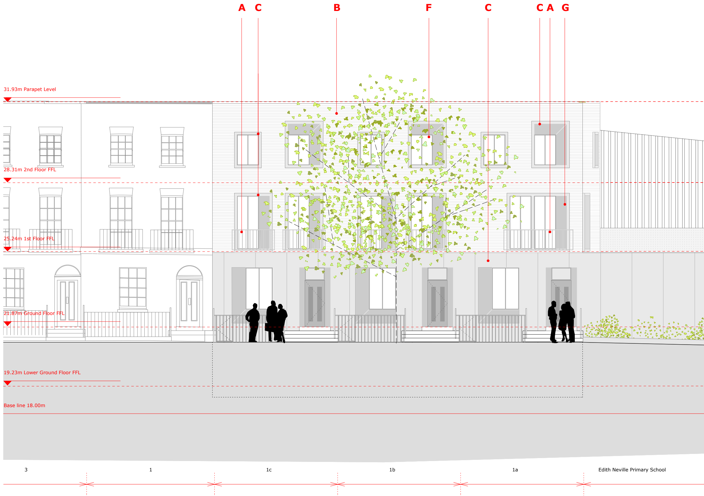
South West Elevation, Charrington Street 1:100