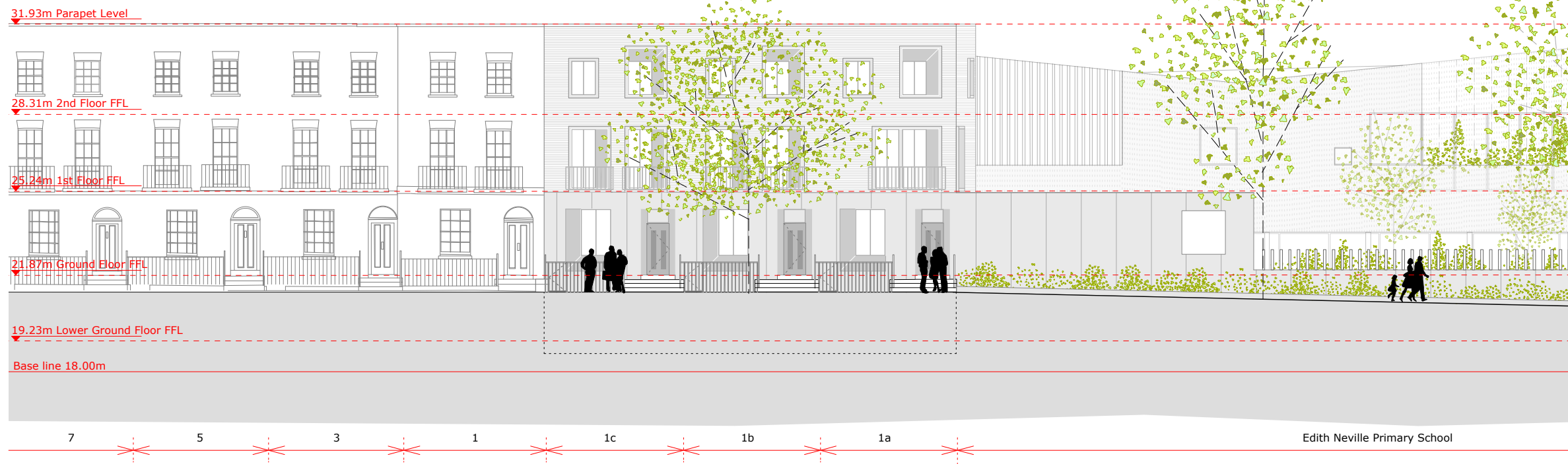
South West Elevation, Charrington Street 1:200