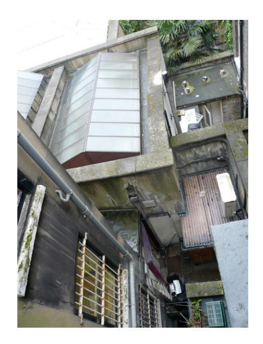
Existing lantern rooflights to 44 & 45

The proposal is to raise the existing parapet walls by approximately 1.3m in order to allow a mezzanine floor to be built within the existing structure. The existing lantern light would be replaced with a low level flat glass rooflight of similar size which would only project approximately 200mm above the ridge height of the existing. The roof and walls would be constructed in materials to match existing. The existing copings would be reused if possible or replaced with new to match.