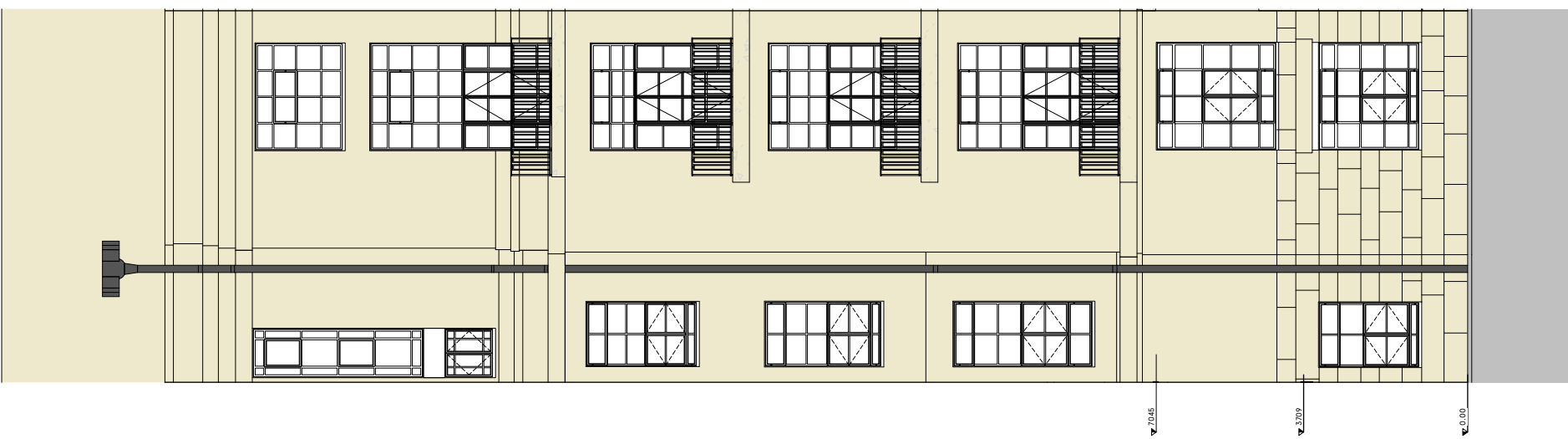
A Lower Ground Floor Courtyard - South Elevation 1:50 @ A0

NOTE This drawing is copyright. Do not scale off dimensions. All dimensions are given in millimetres. It is the responsibility of the client to check for any discrepancies, errors or omissions prior to commencing on site.