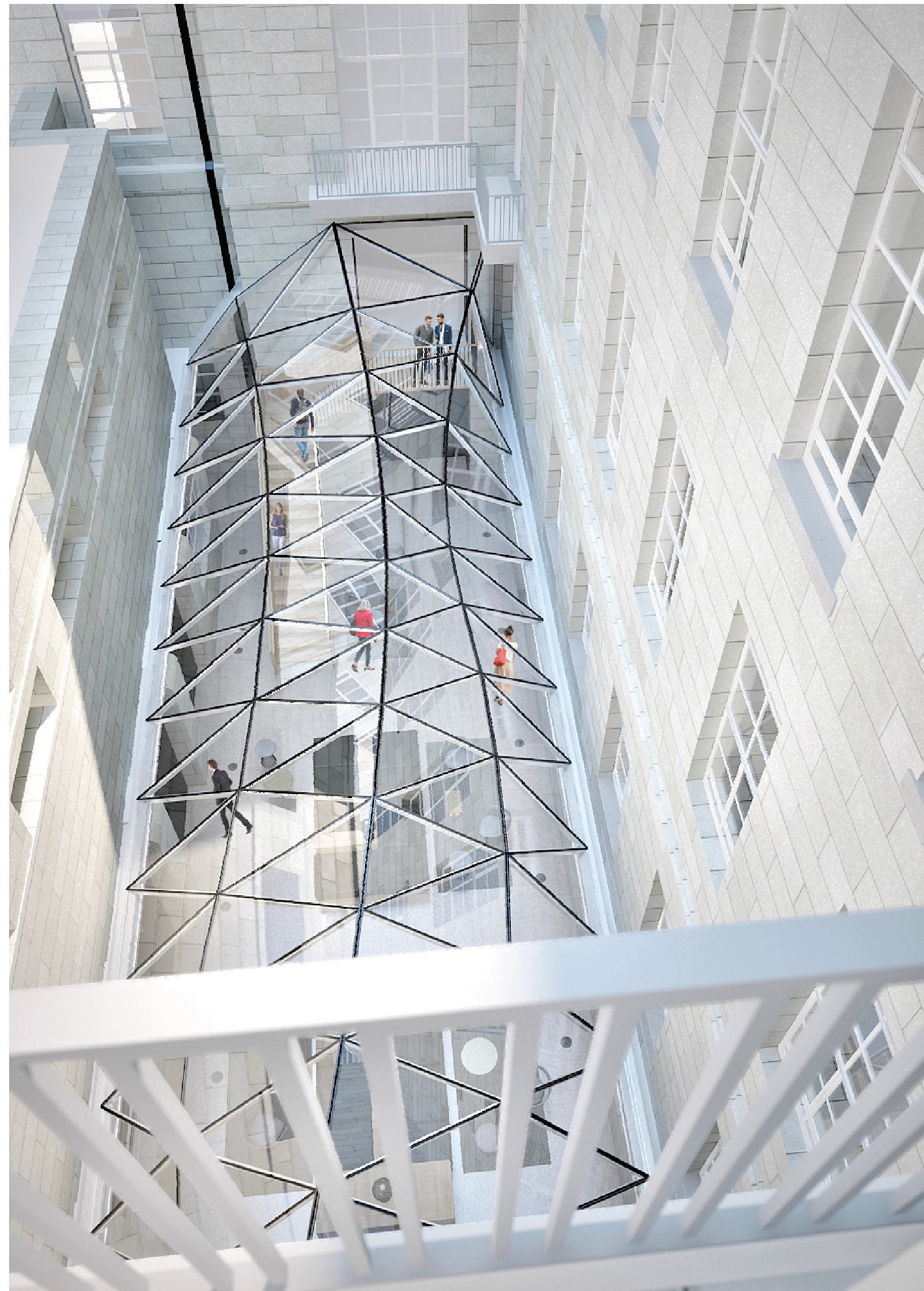
A LGF_3D Visual_Courtyard_View 04 NTS

NOTE This drawing is copyright. Do not scale off dimensions. All dimensions are to be checked on site by contractor. Contractor to report any dimensional discrepancies, errors or omissions prior to commencing on site.